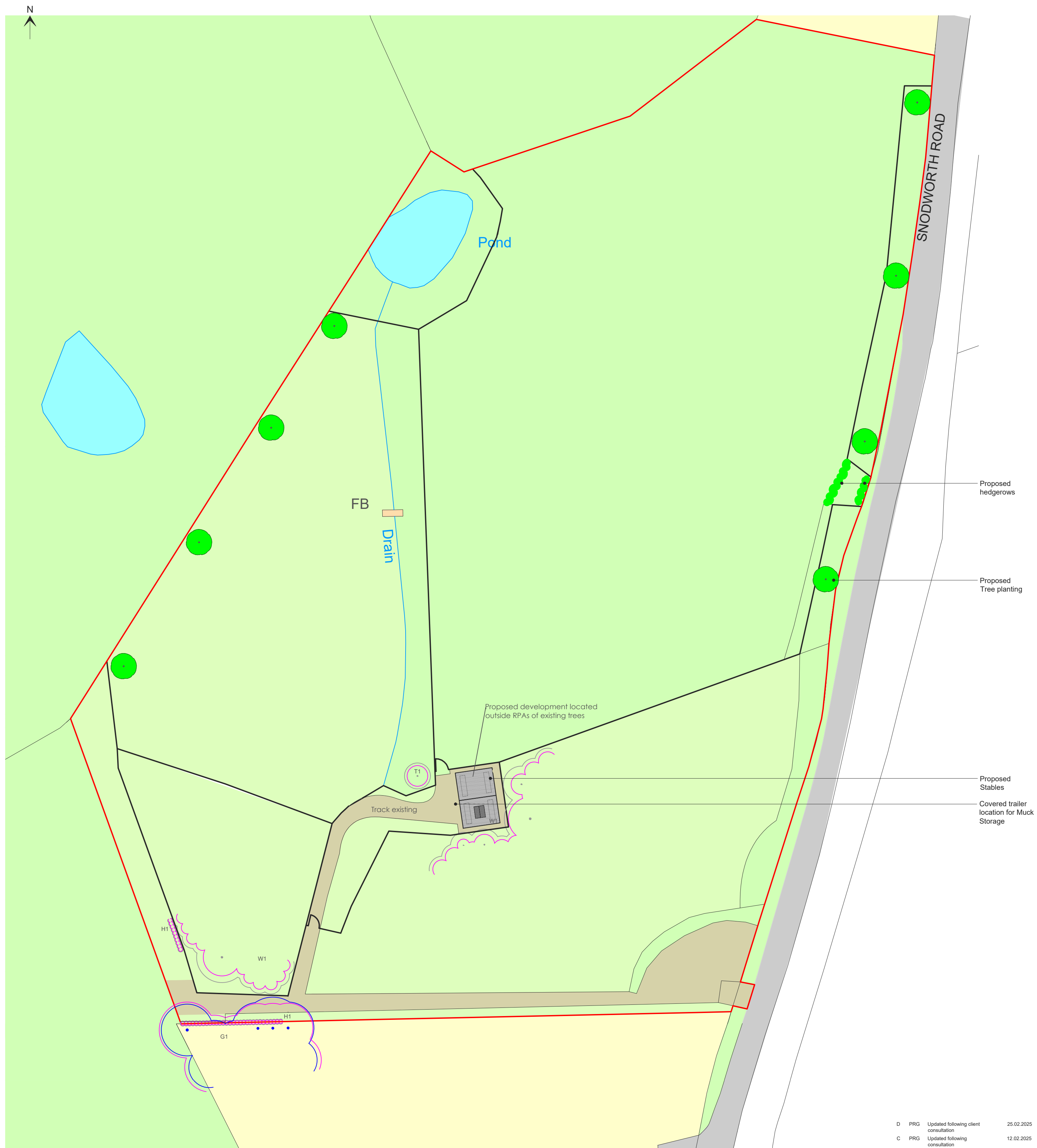
PROPOSED SITE PLAN Scale 1:500