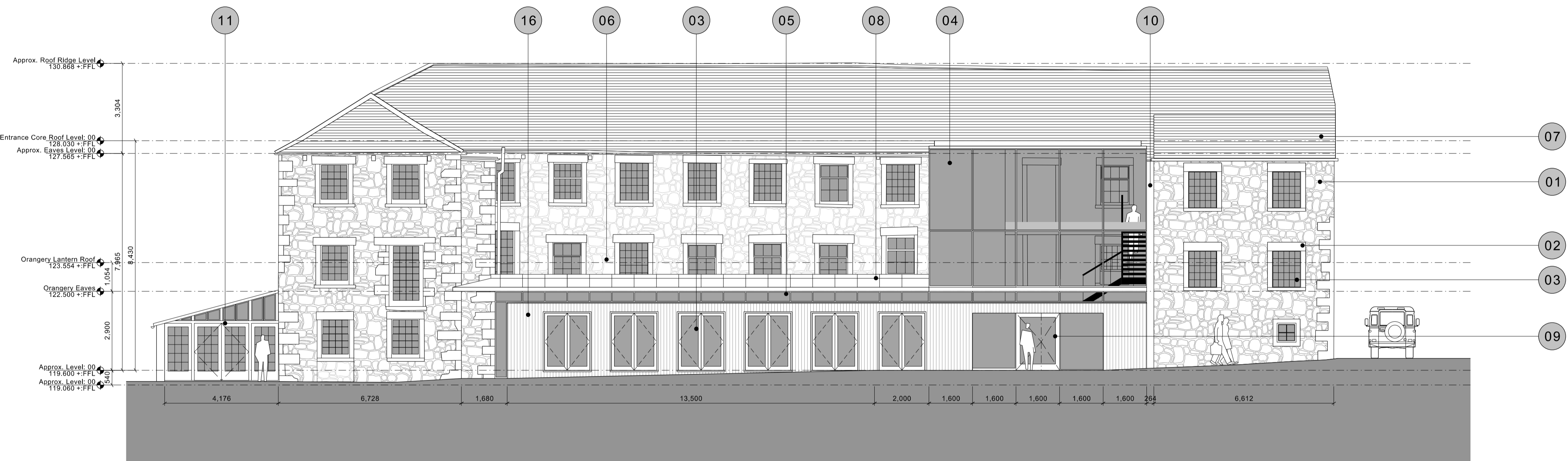
Elevation 01 (South Facing)