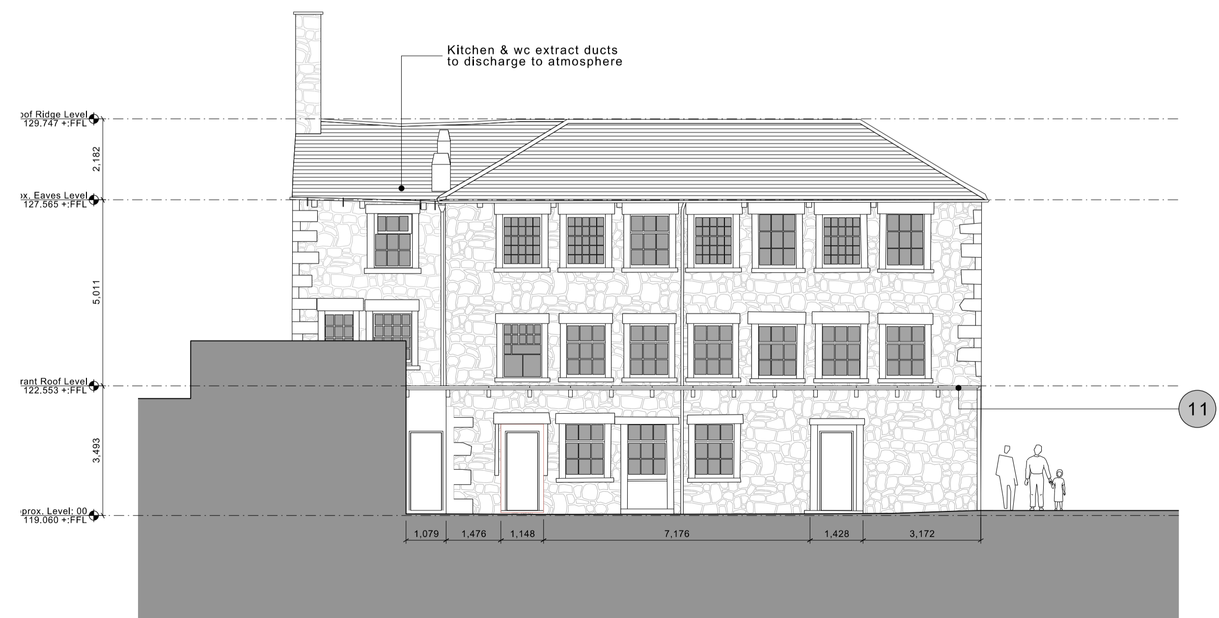
Elevation 03 (West Facing)