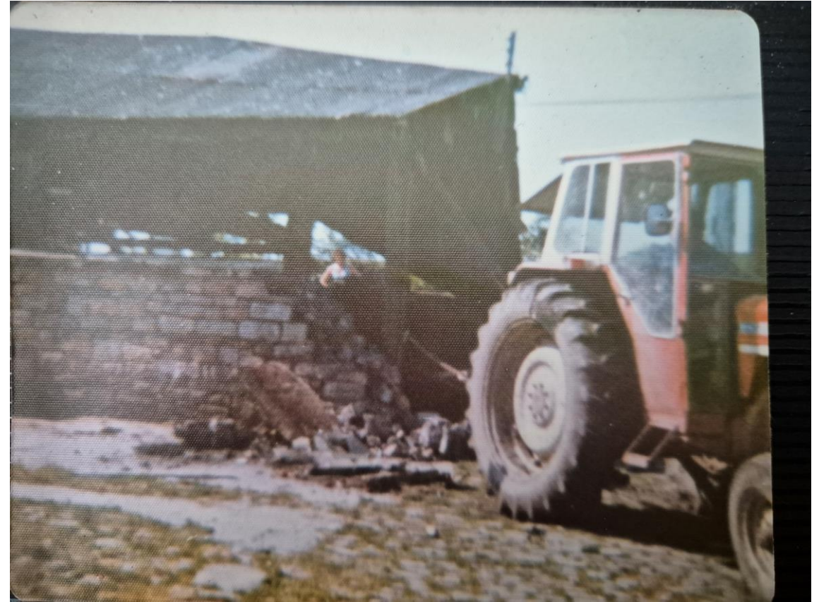
Image highlighted shows extent of 3. Higher West Section footprint, then start of demolition to this section. Unfortunately, the photographs for this part of the barn are limited.