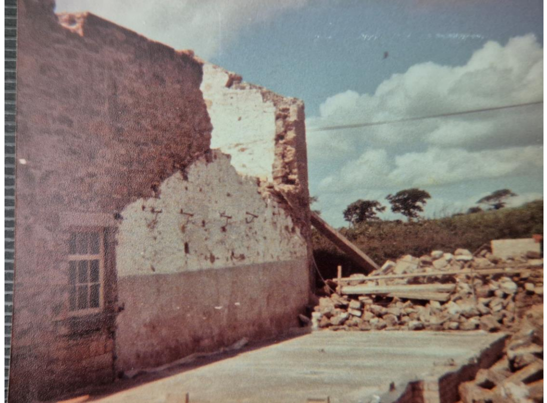
Lower East section prior to demolition and footprint following demolition