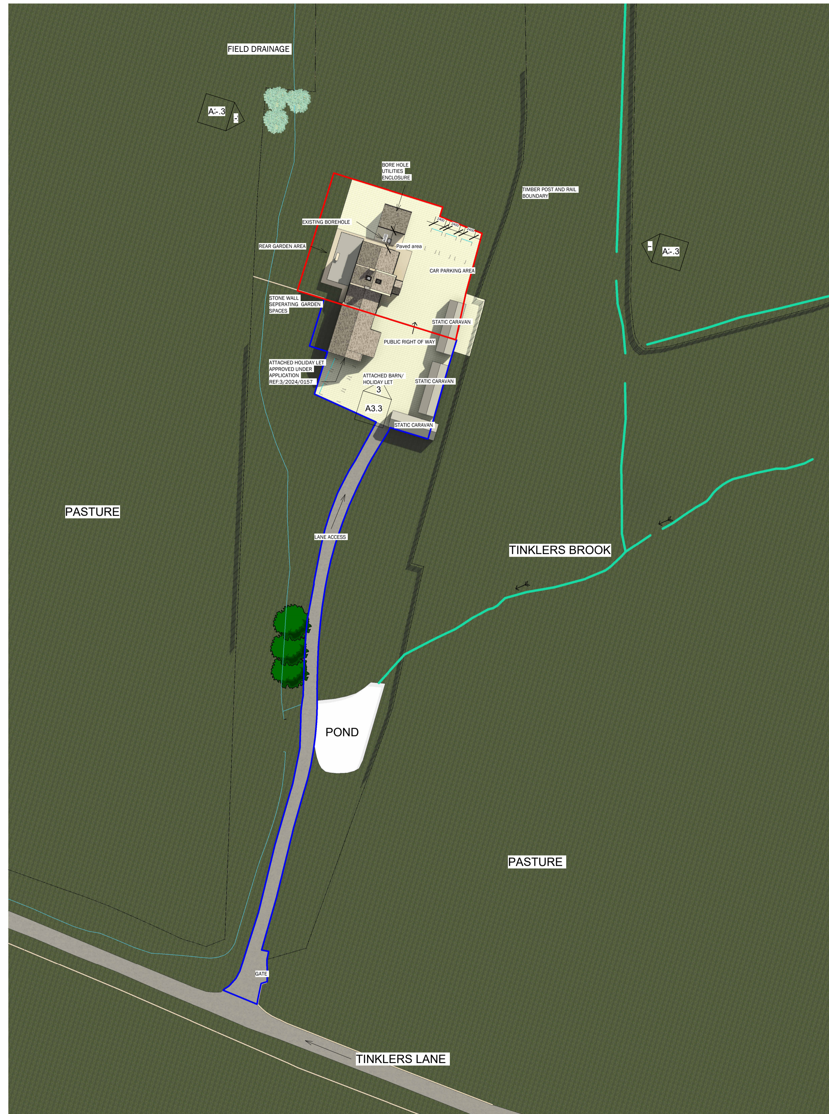
1 PROPOSED SITE PLAN 1 : 500