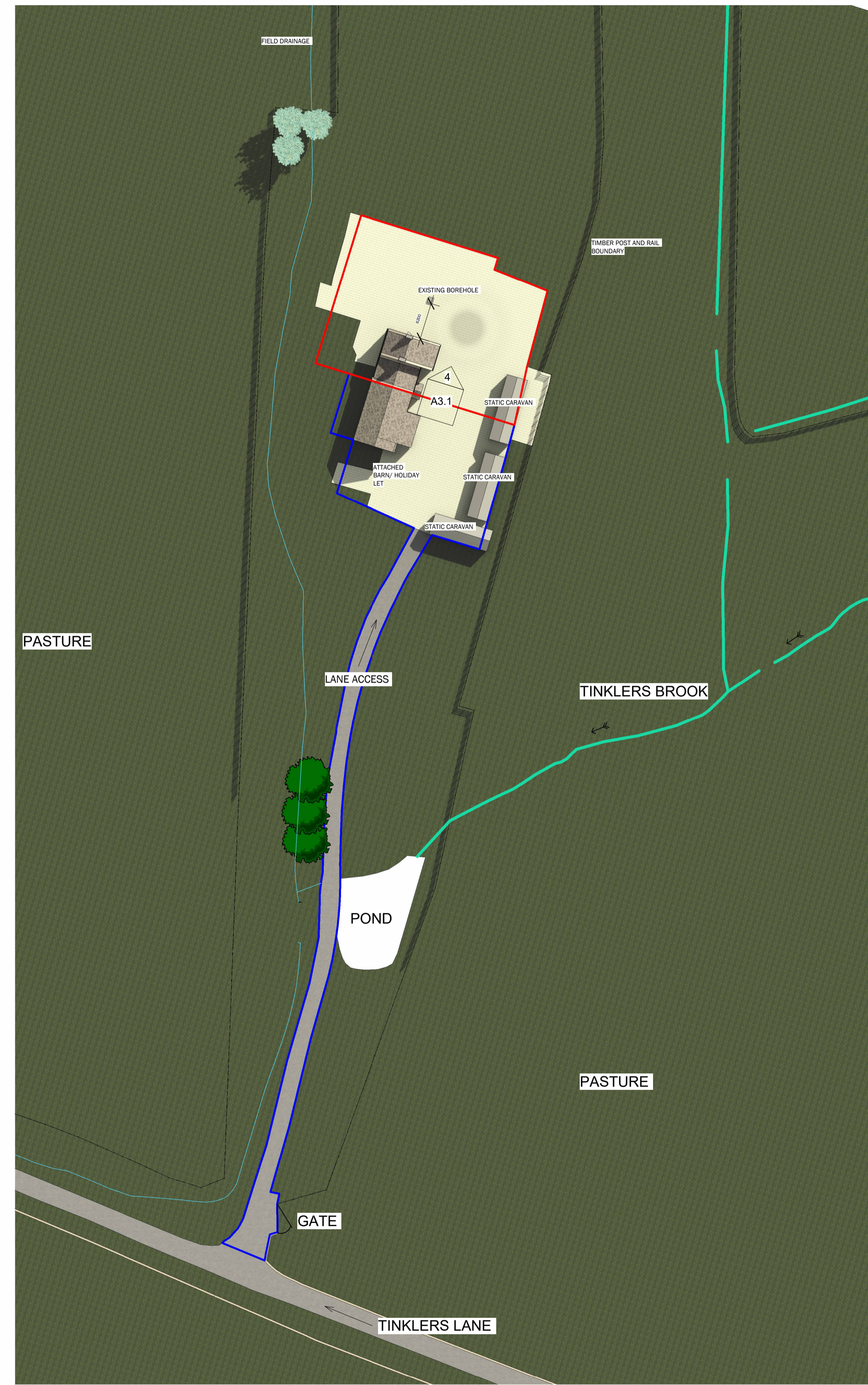
1 EXISTING SITE PLAN 1 : 500