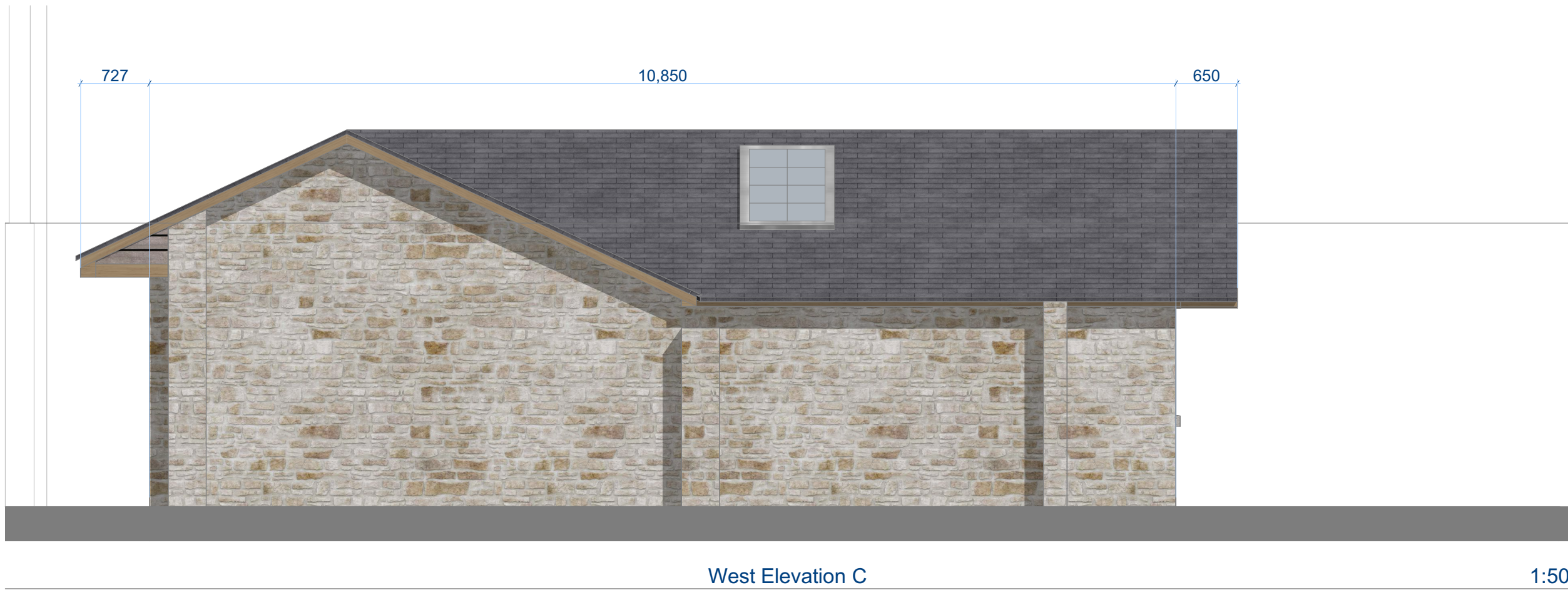
West Elevation C