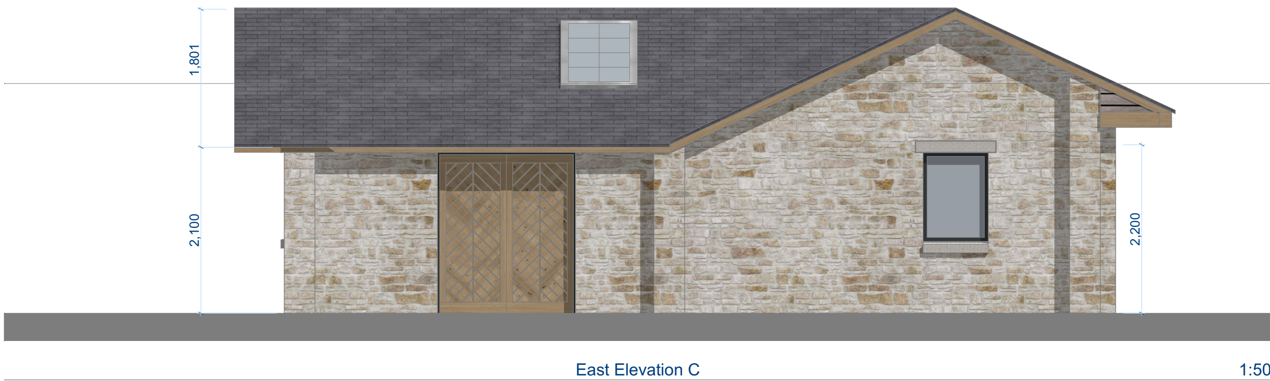
East Elevation C