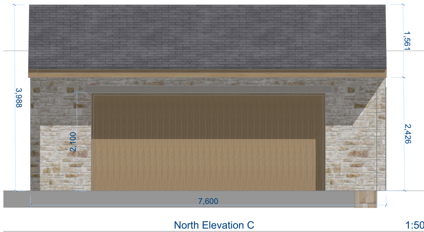
North Elevation C