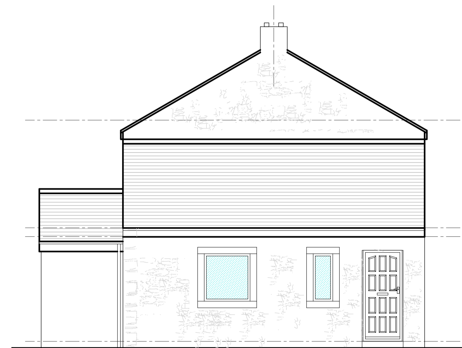
Existing Elevation D Scale 1:50

2) All dimensions shown on this drawing are in meters/millimeters unless otherwise noted. 3) The contractor is to confirm all dimensions on site prior to commencing work and advise of any discrepancies immediately to the Architect.