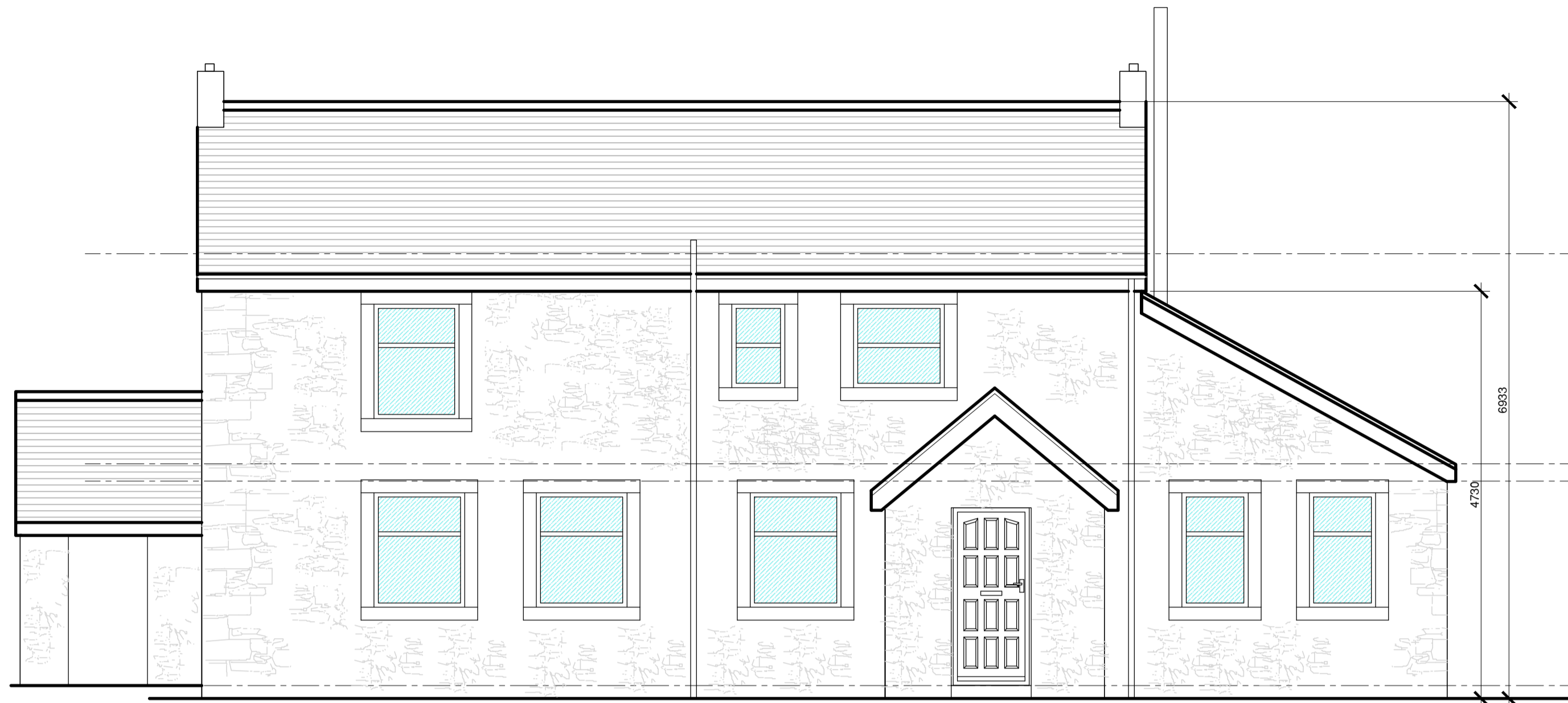
Existing Elevation A Scale 1:50