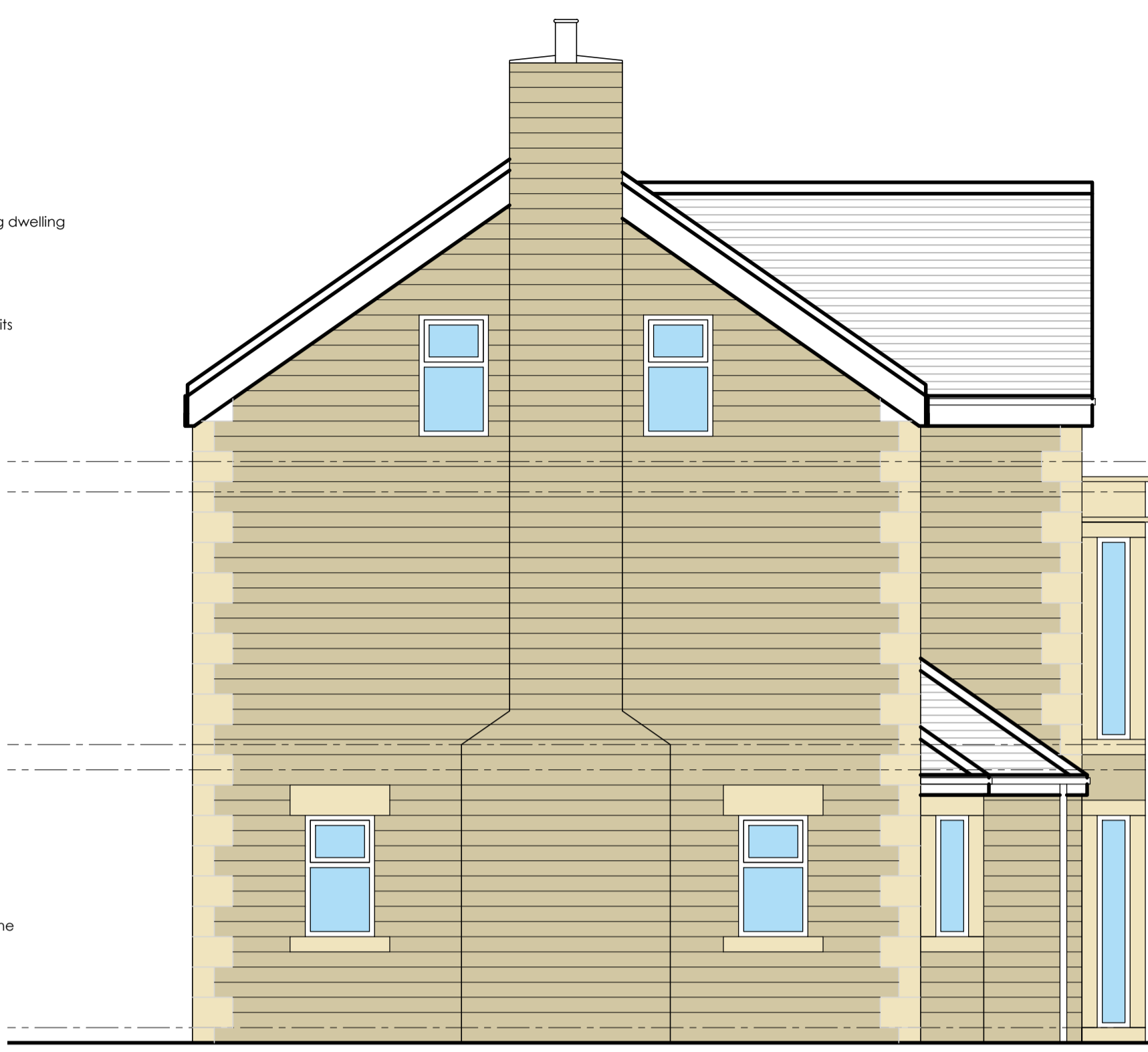
Proposed Elevation B Scale 1:50