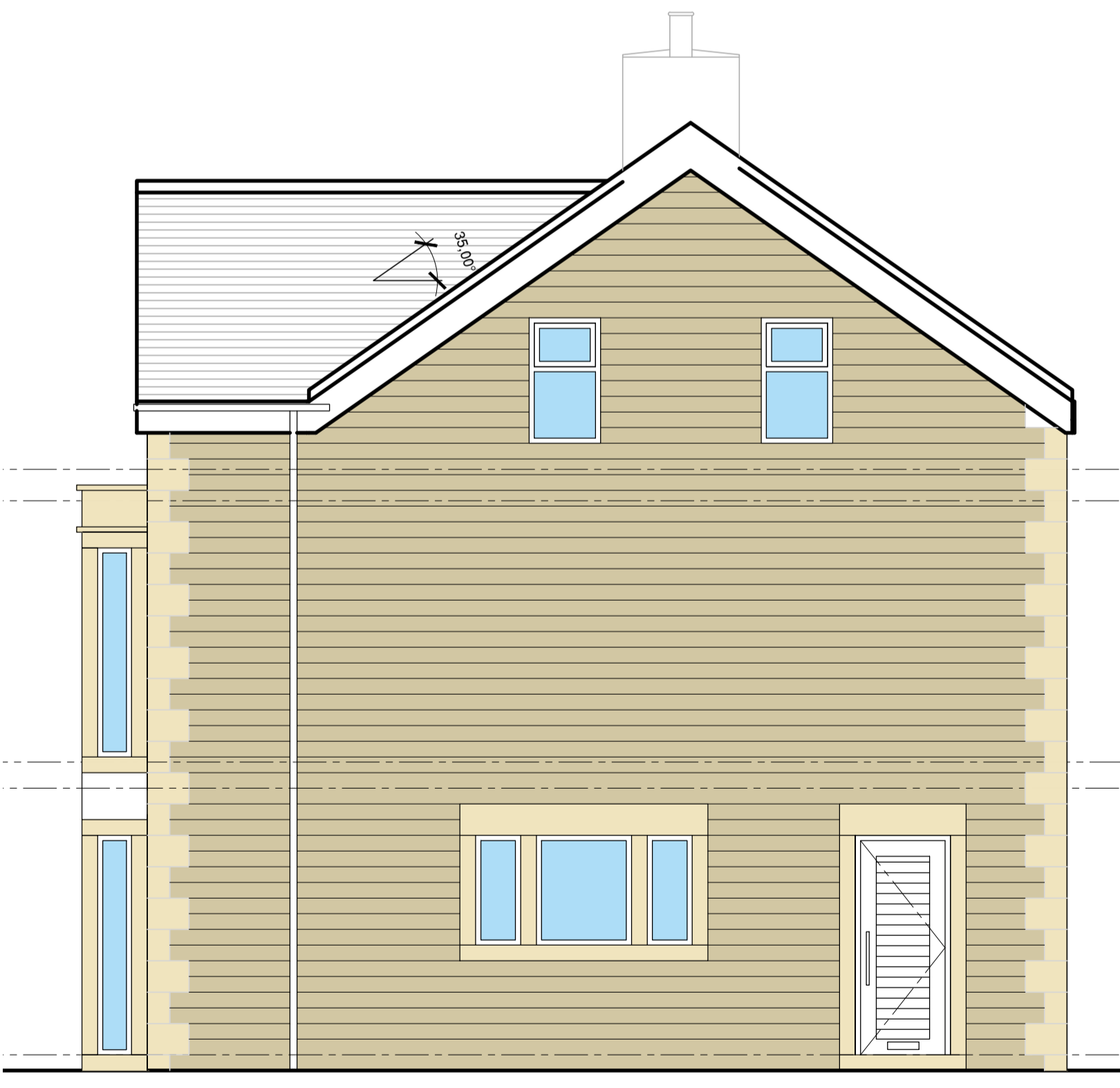
Proposed Elevation D Scale 1:50

2) All dimensions shown on this drawing are in meters/millimeters unless otherwise noted. 3) The contractor is to confirm all dimensions on site prior to commencing work and advise of any discrepancies immediately to the Architect.