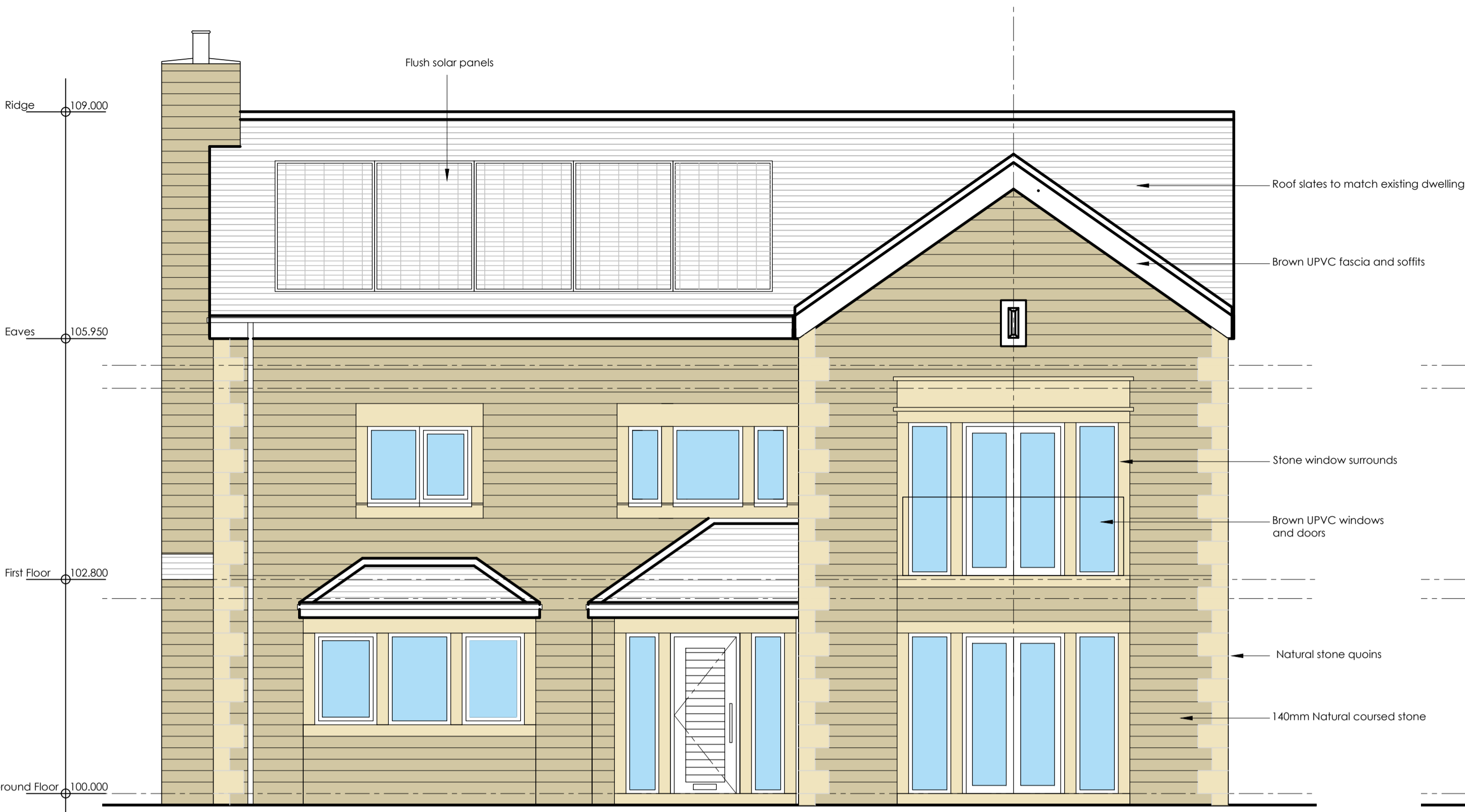
Proposed Elevation A Scale 1:50