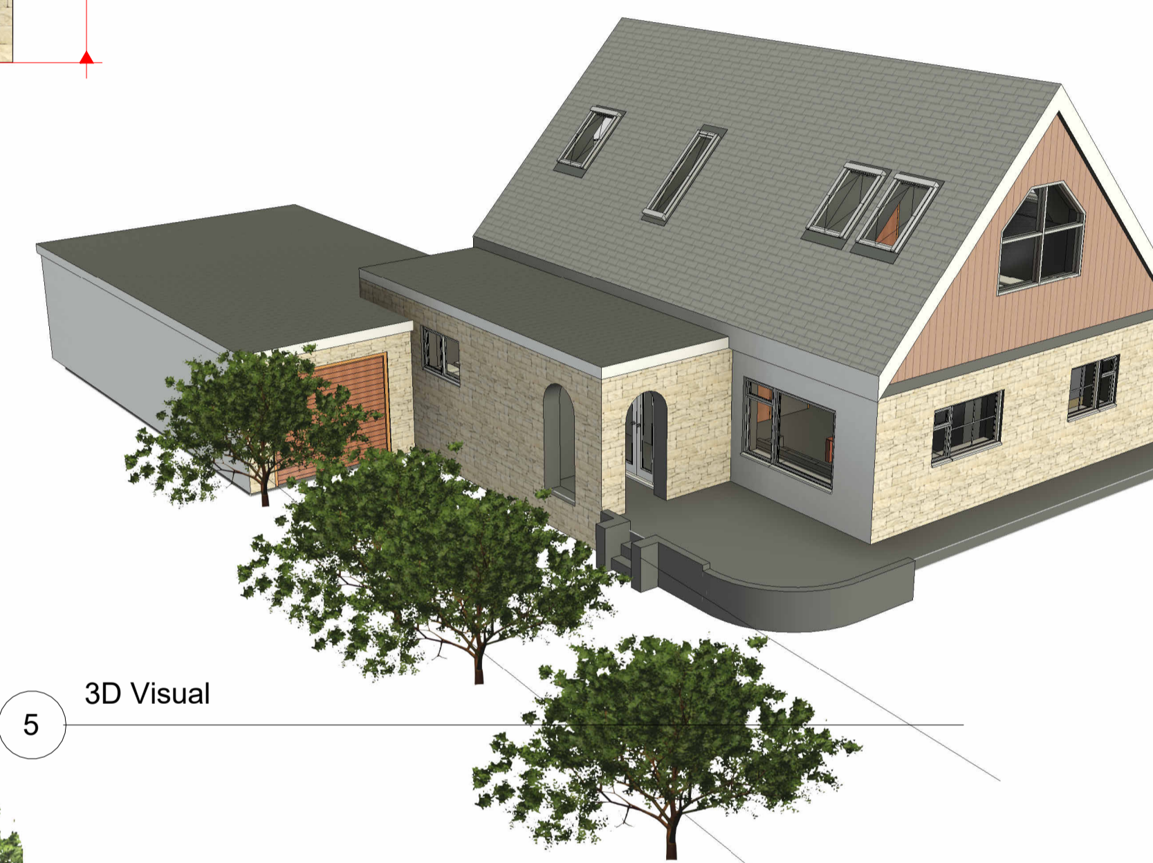
5 3D Visual