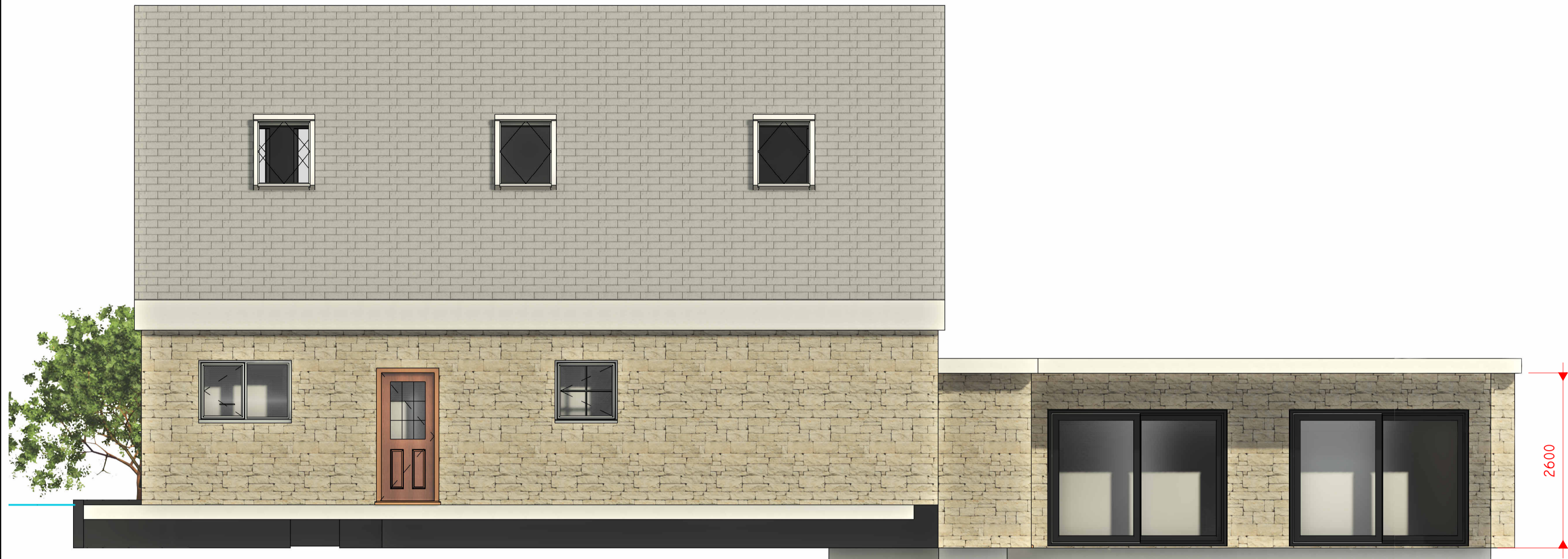
1 PROPOSED SOUTH 1 : 50