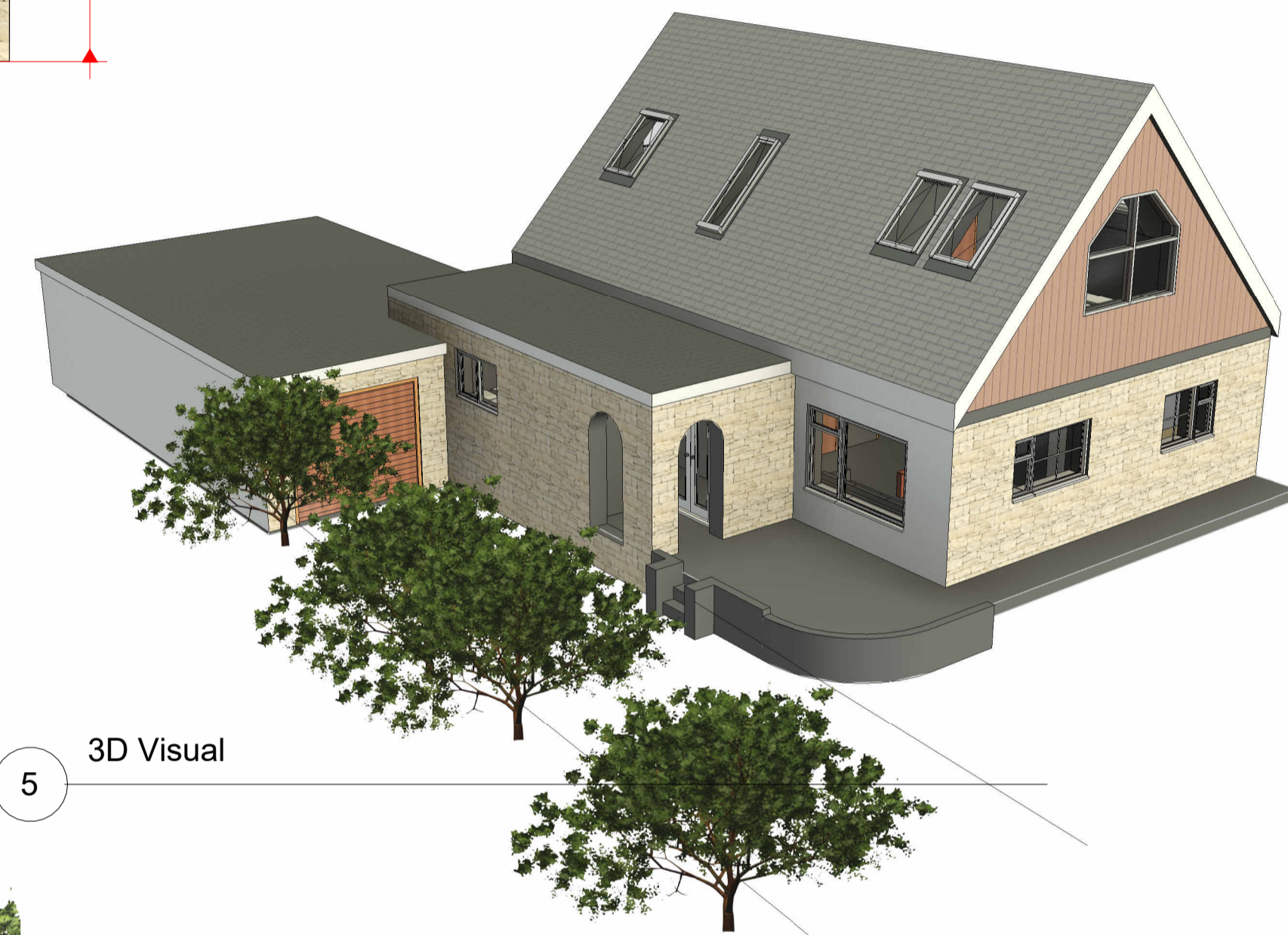
5 3D Visual