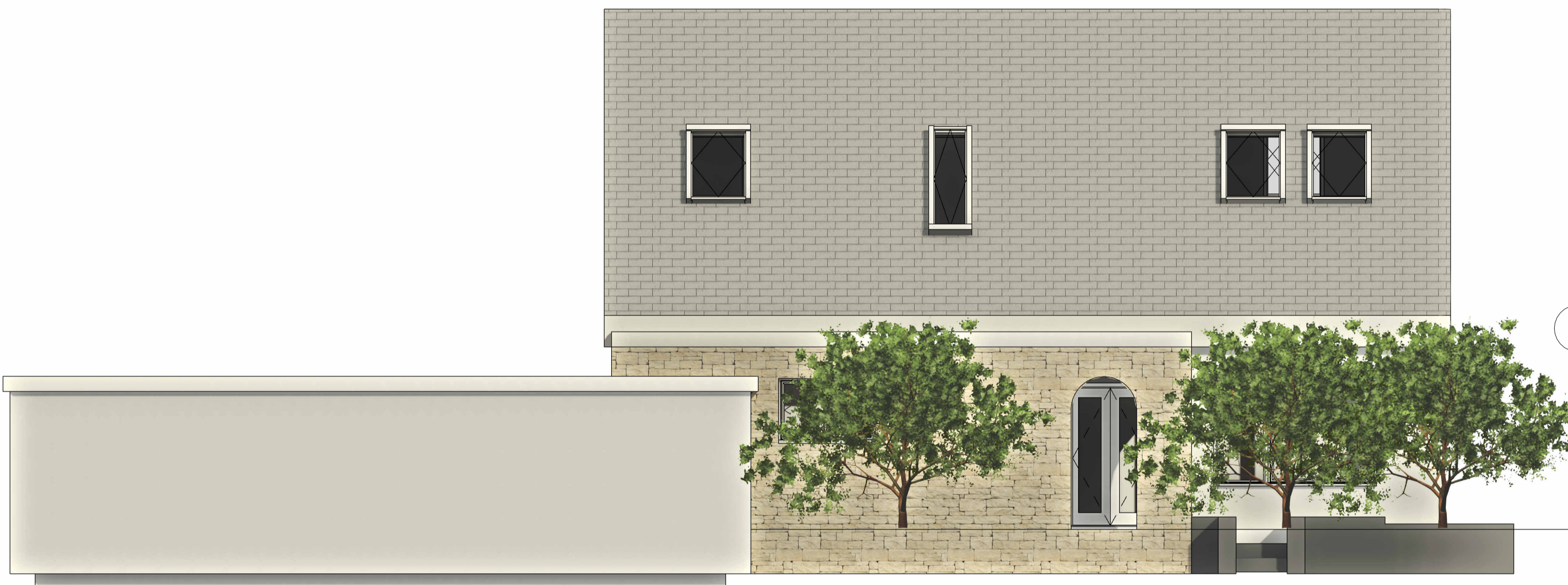
2 PROPOSED NORTH 1 : 50