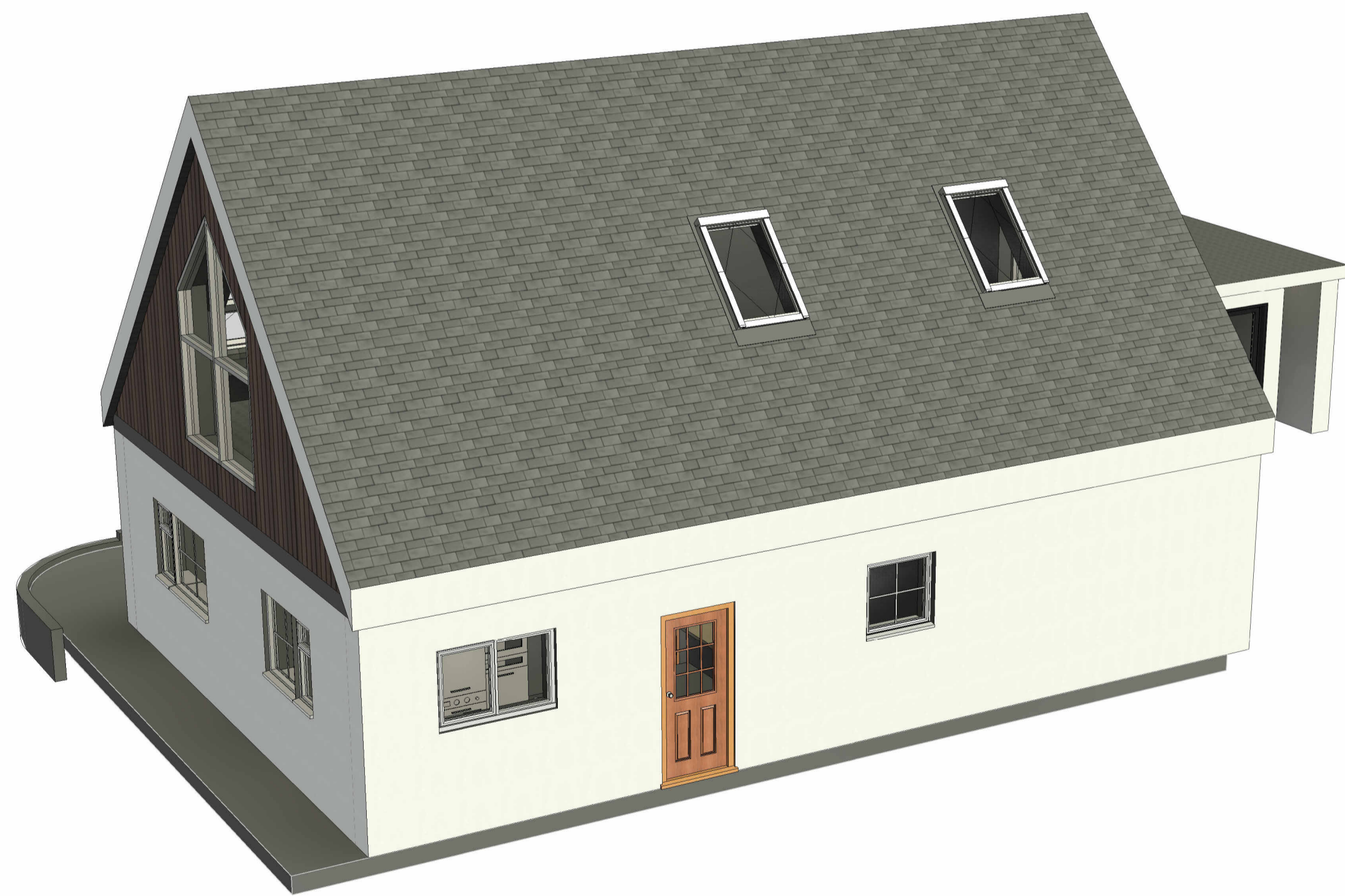
3 3D View 4