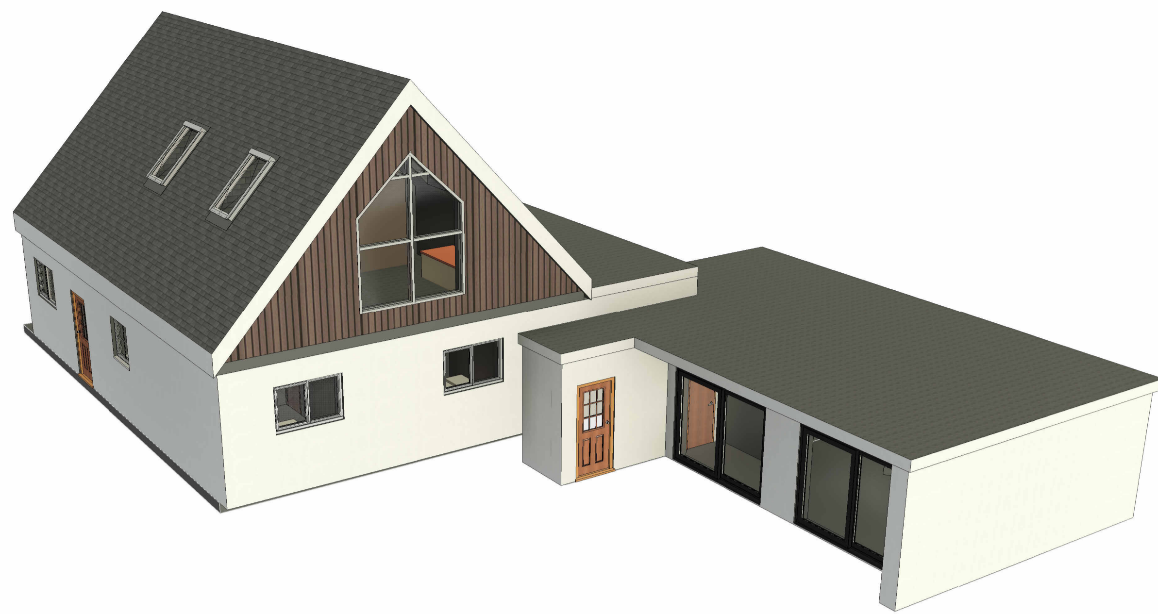
1 3D View 1