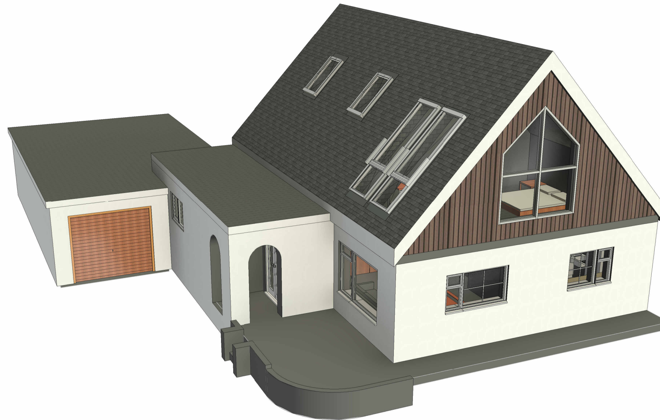
2 3D View 2