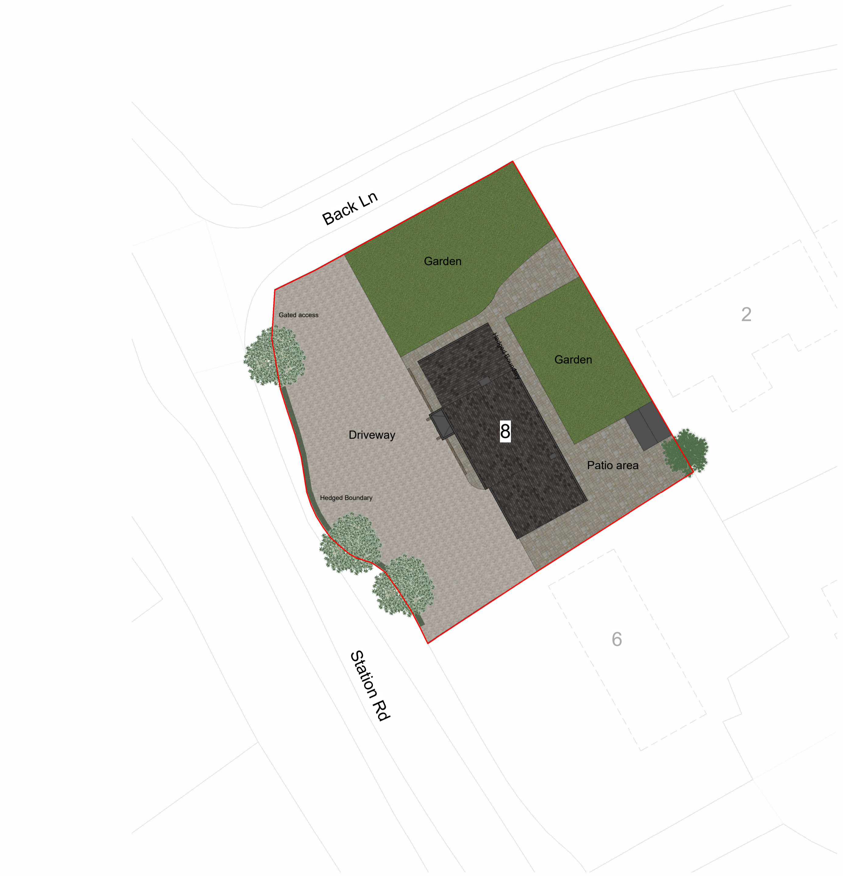
1 Existing Site plan 1 : 200