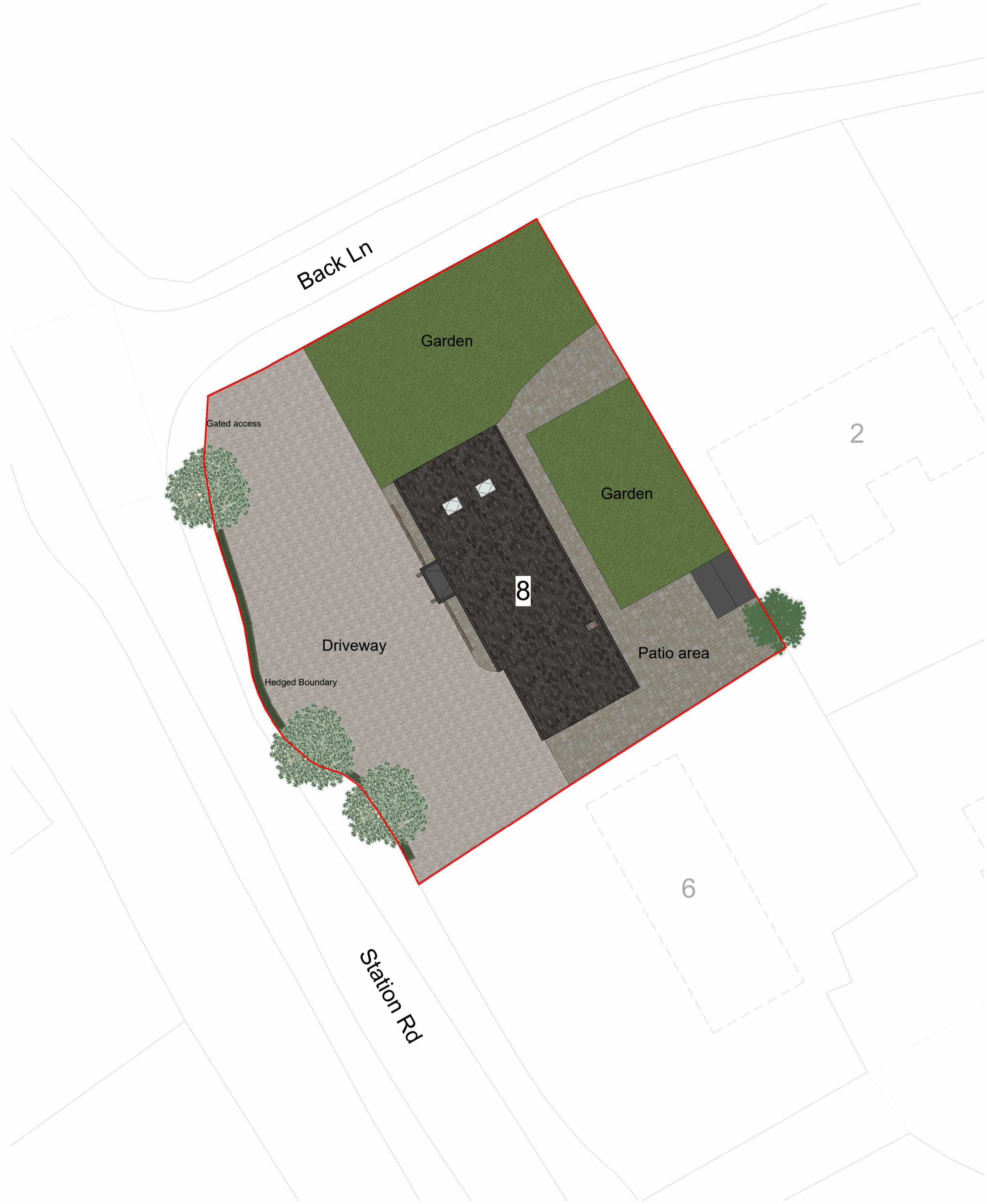
1 Proposed Site Plan 1 : 200