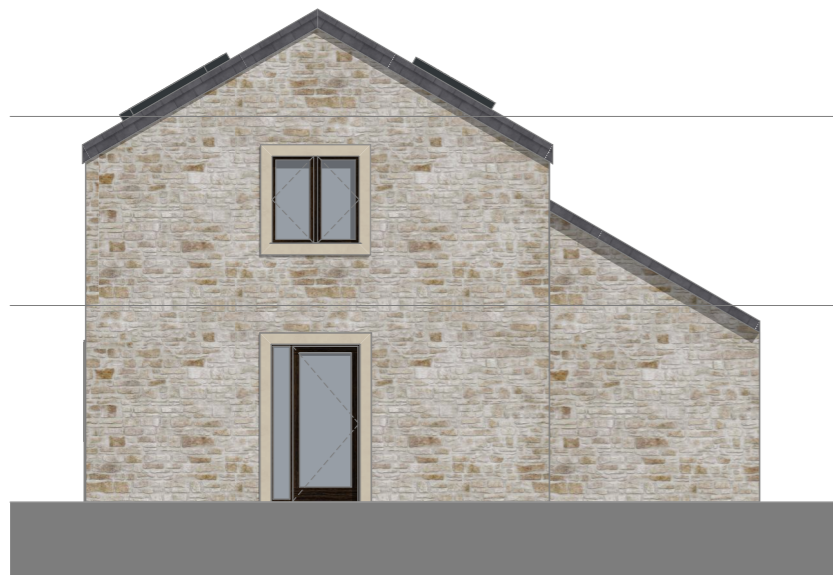
South West Elevation 1:100