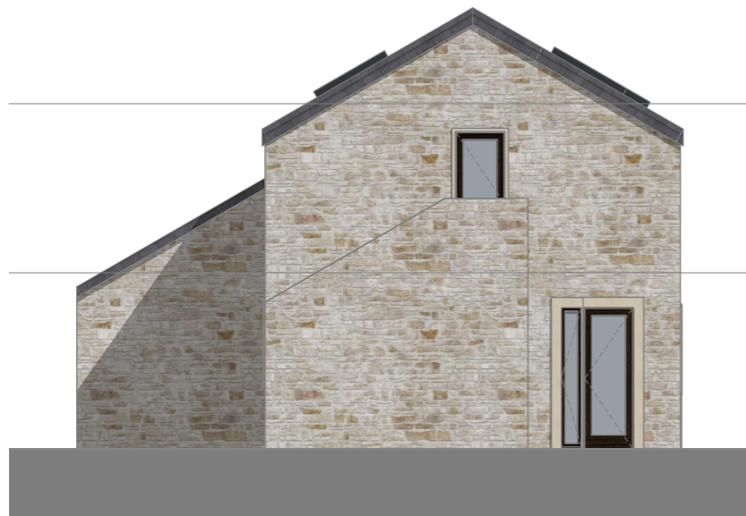
North East Elevation 1:100