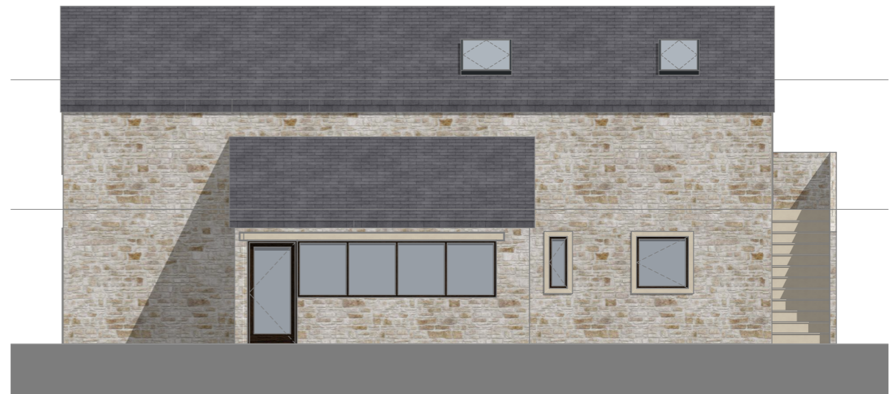
South East Elevation 1:100

Please note drawings have been produced following information provided from client. No survey has been undertaken.