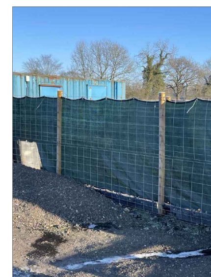
DOG EXERCISE FIELD - FENCING DETAIL FENCE - 1800mm HIGH POSTS WITH MESH AND INTERNAL WIRING.