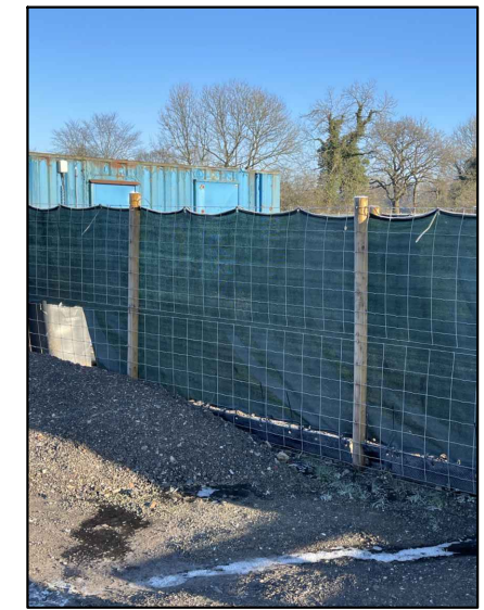
DOG EXERCISE FIELD - FENCING DETAIL FENCE - 1800mm HIGH POSTS WITH MESH AND INTERNAL WIRING.