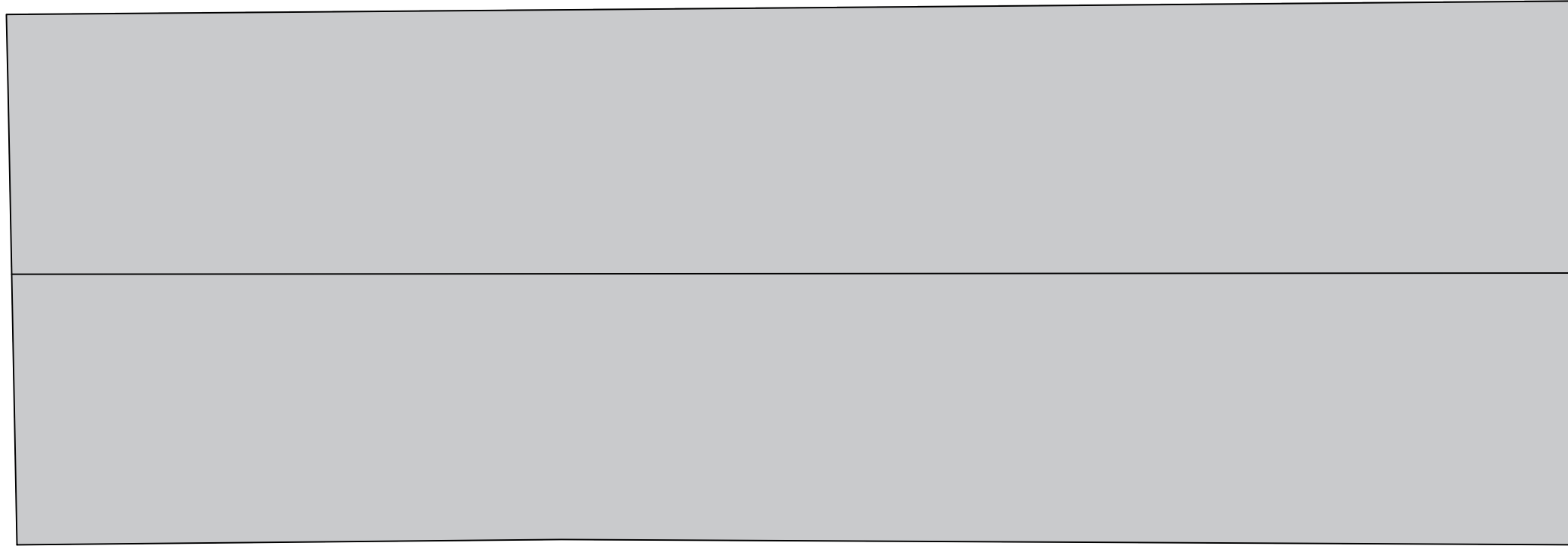
EXISTING ROOF PLAN Scale 1:100

This drawing is to be read in conjunction with all relevant Architect, consultants' and specialists' drawings and specifications. The Architect is to be notified of any discrepancies before proceeding. Do not scale from this drawing. All dimensions and levels are to be checked on site. This drawing is subject to copyright. All work carried out before Planning and Building Permission has been granted is at the contractor/clients risk. Note: proposed drawing based on OS dwg information. All illustrated dimensions are approximate and all site dimensions are to be checked on site and subject to site survey.