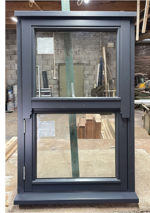
3 | Rear Windows - Mock Sash in White