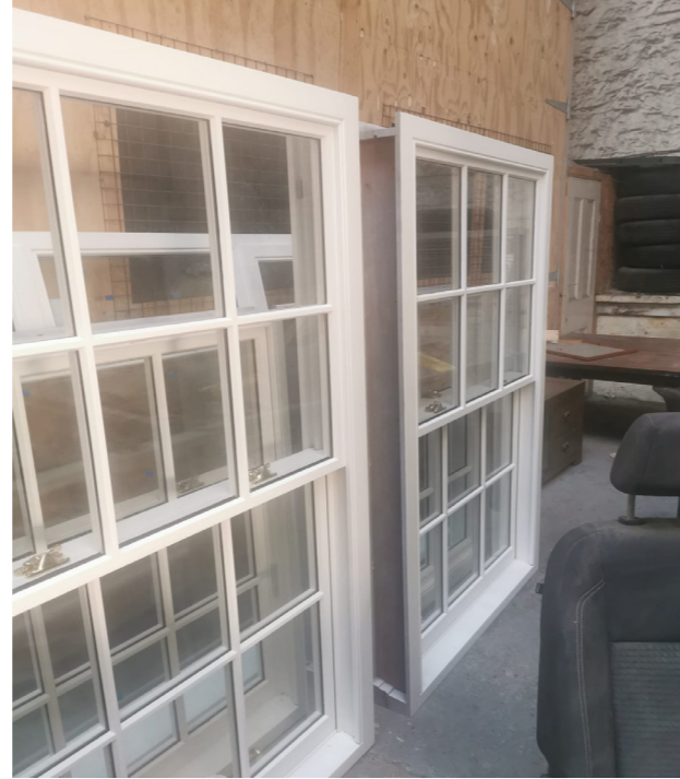
2 | Front Upper Windows -White