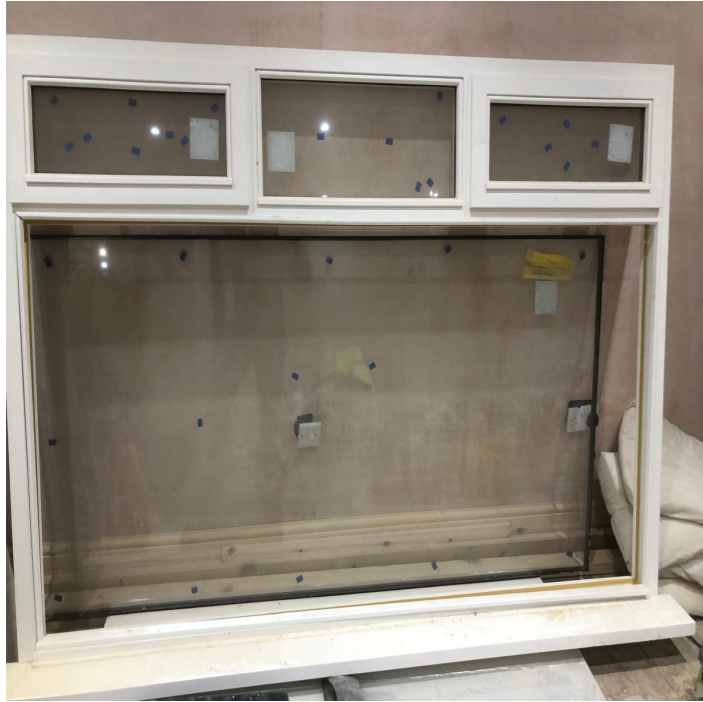
1 | Front Shop Window - White