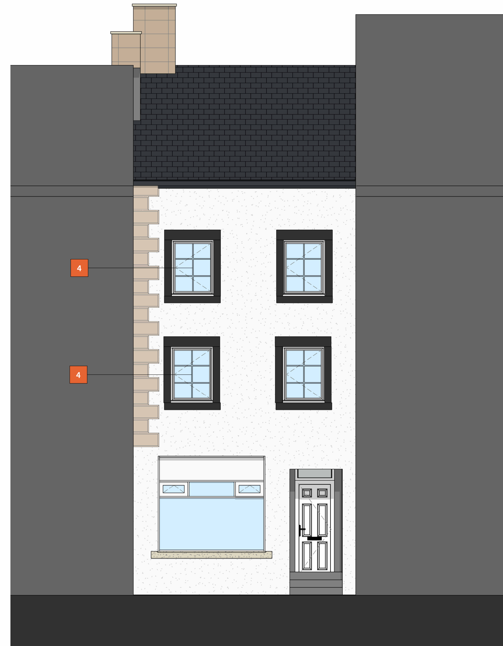
2 South Elevation as Proposed LBC 1:50