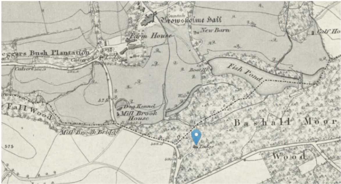
Figure 1 1840-1880 1st Edition OS Map