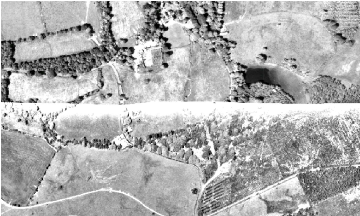
Figure 2 1960's Aerial photograph showing the lodge