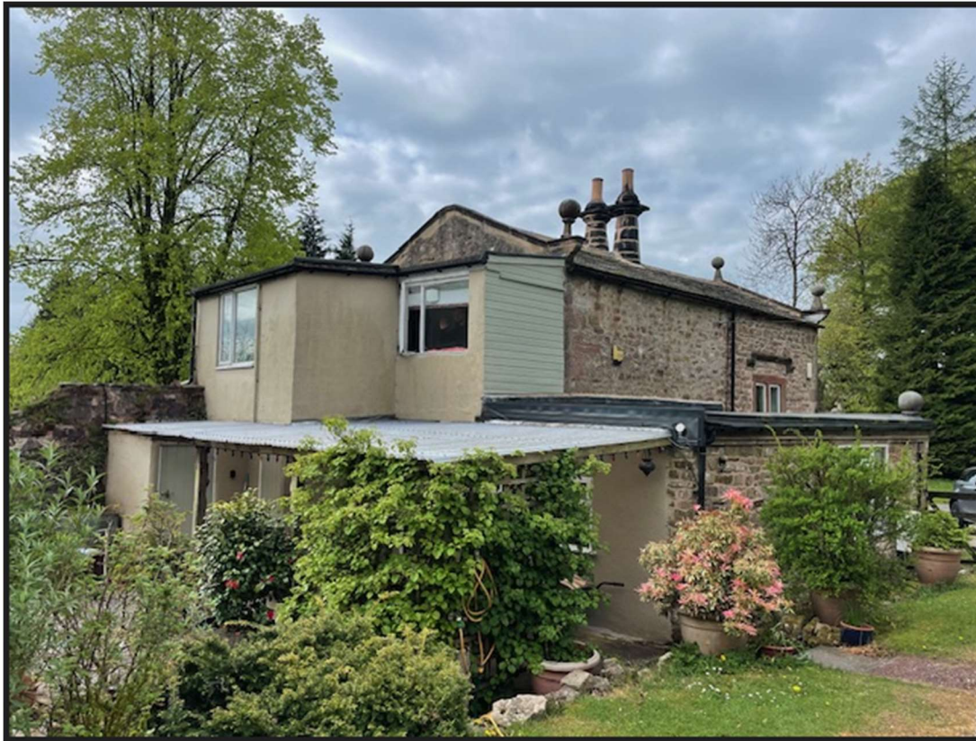
Figure 5 2024 Photograph of the Front Elevation showing the Previously Extended Areas