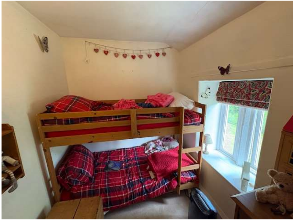
View showing the existing bedroom to become the new bathroom