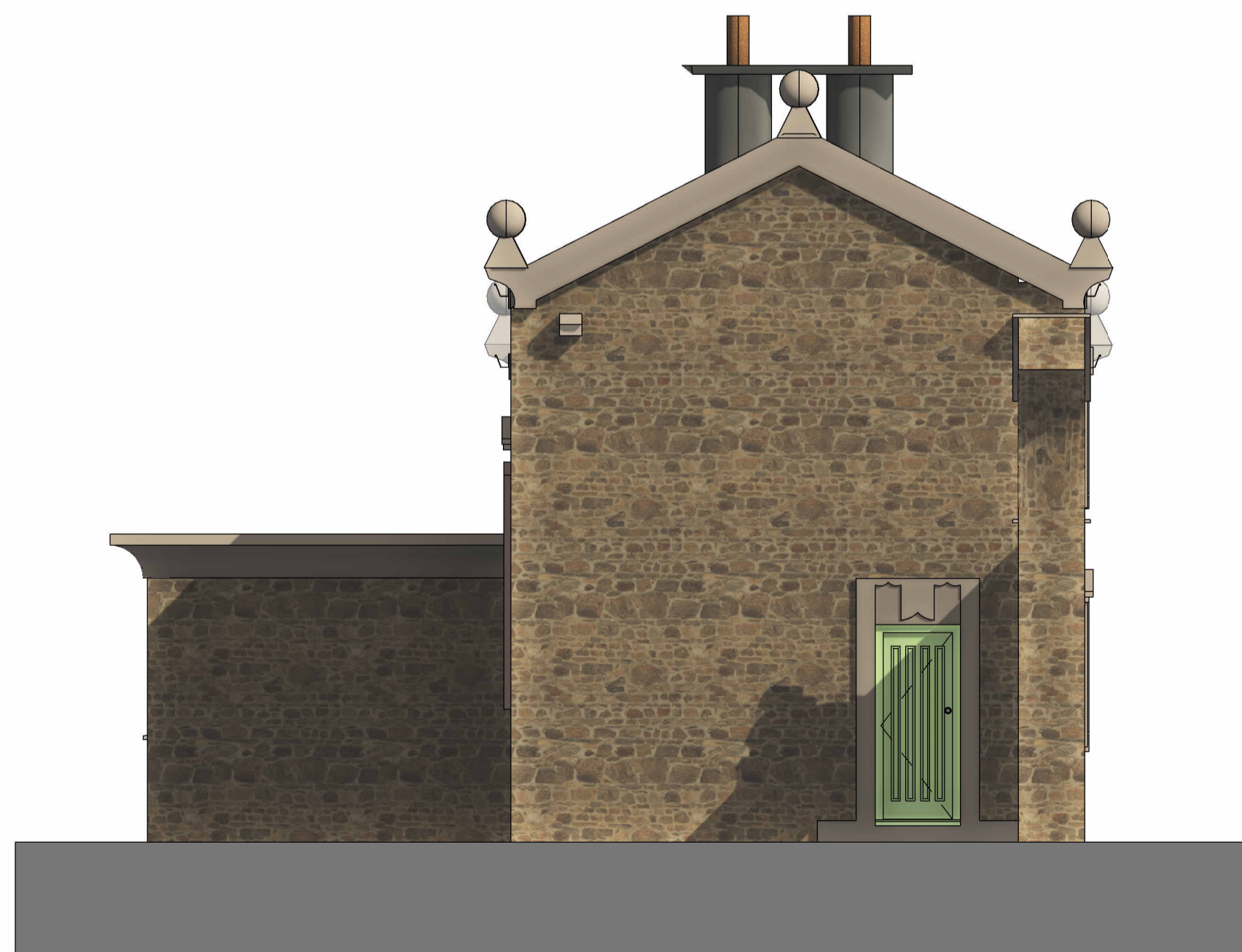
4 PROPOSED WEST 1 : 50