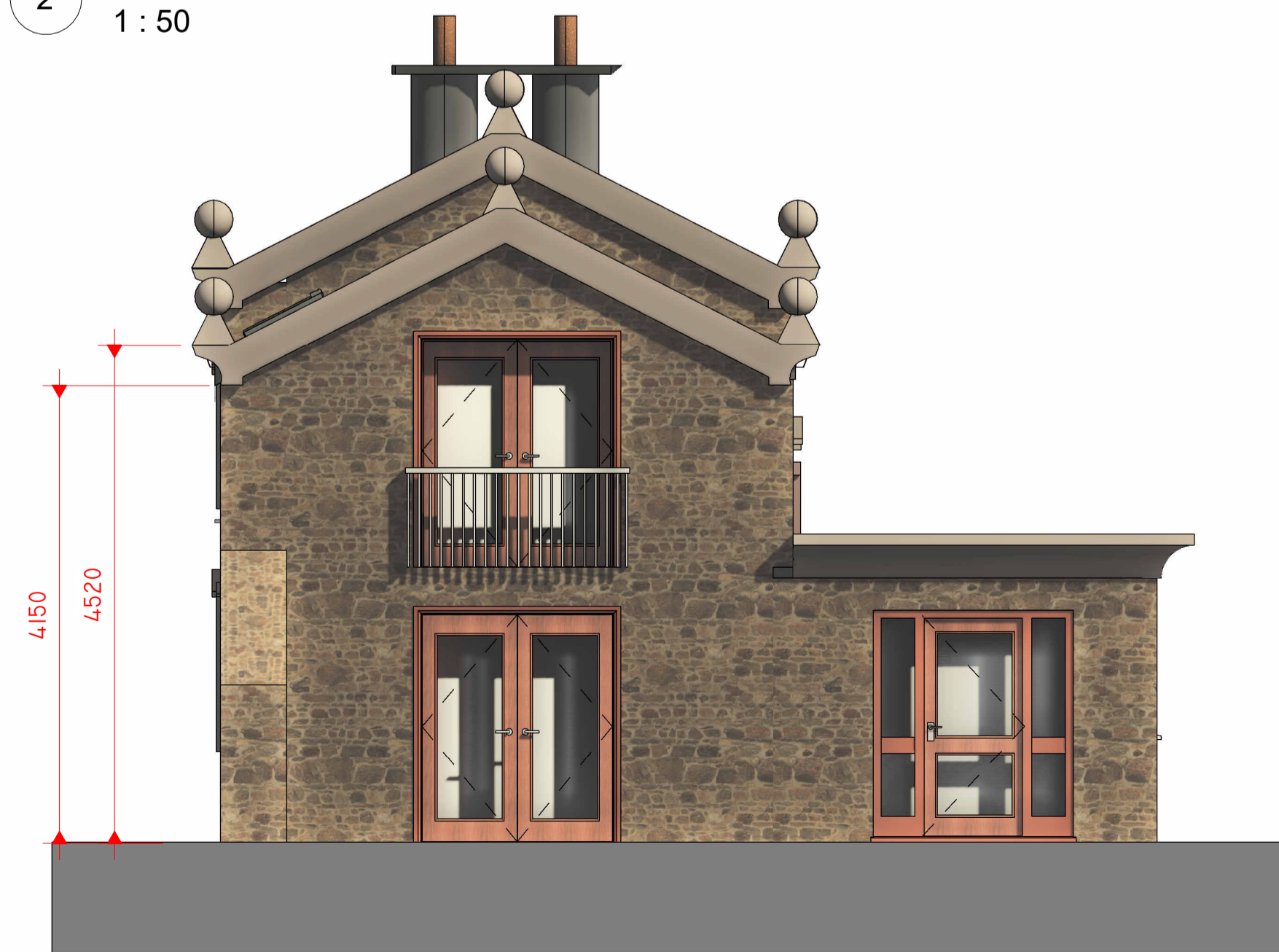
3 PROPOSED EAST 1 : 50