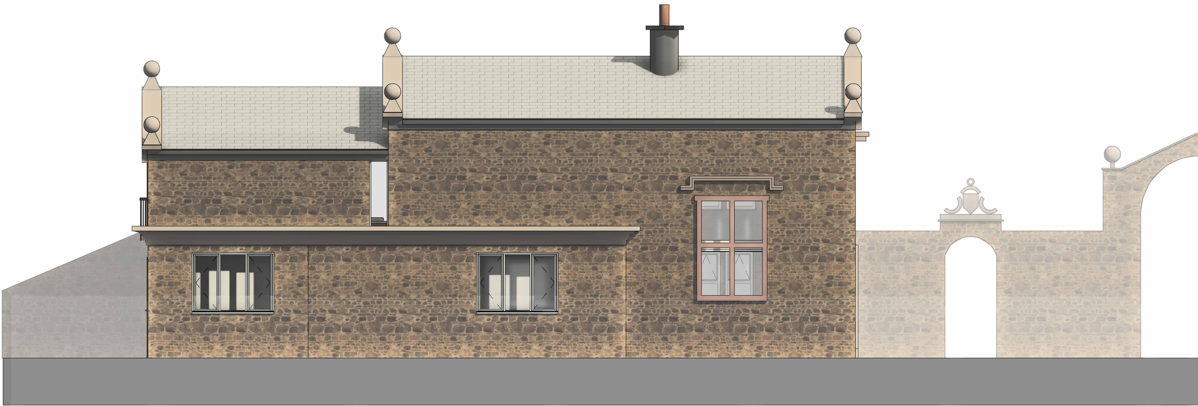
1 PROPOSED NORTH 1 : 50