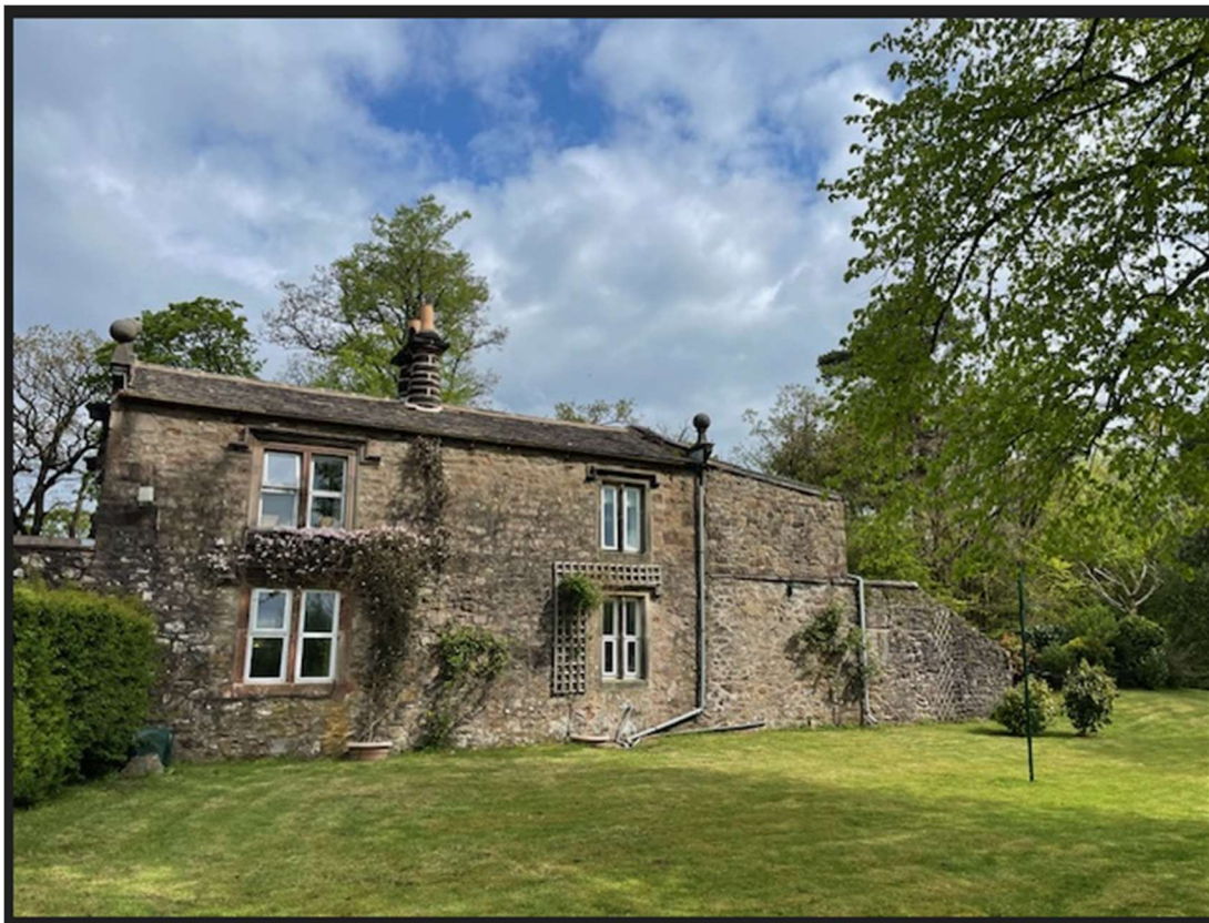
Figure 2 2024 Rear Elevation Photograph of the Lodge

4.4: On the exterior of the 19 th C building there are a large number of intricate stone details which add character such as the historic crest said to have been taken from Waddington Hall, several Ball Finials, stone window and door surrounds, corbels and a figure of a saint taken from Whalley abbey. The adjoining archway was formerly from Ingleton Hall, Settle.