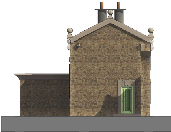
4 PROPOSED WEST 1 : 50