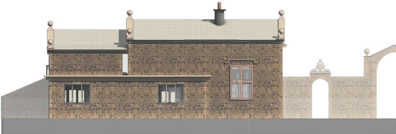
1 PROPOSED NORTH 1 : 50

For planning approval and listed building consent only