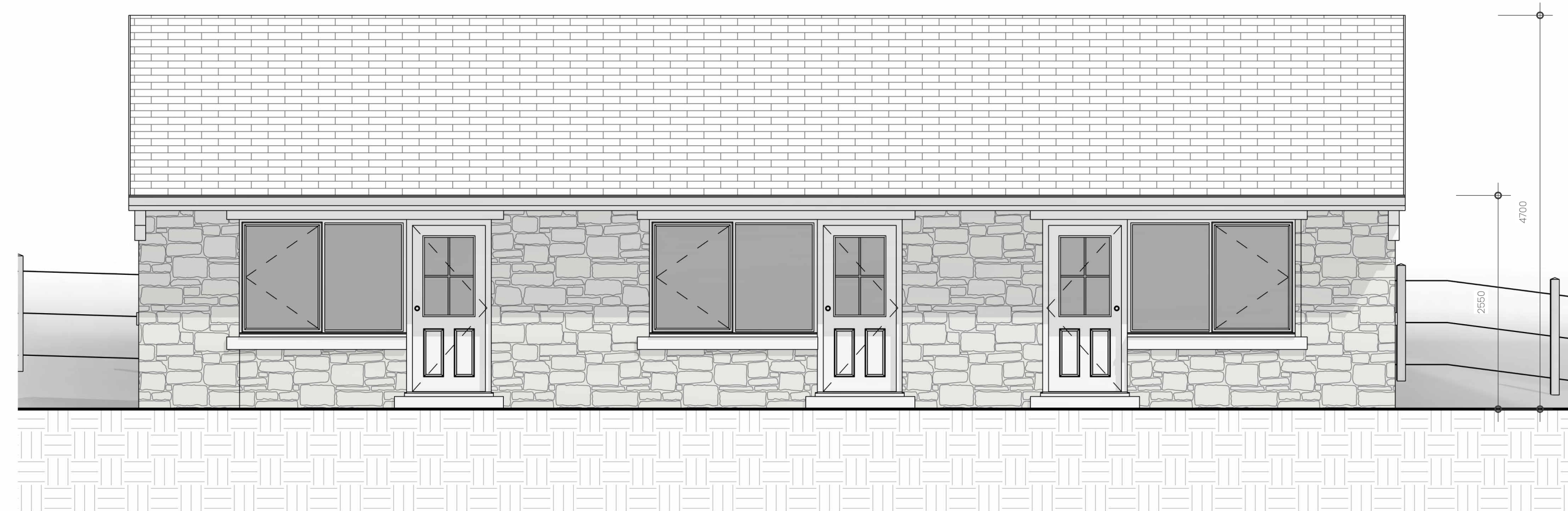
5 Previously Approved South West 1: 50