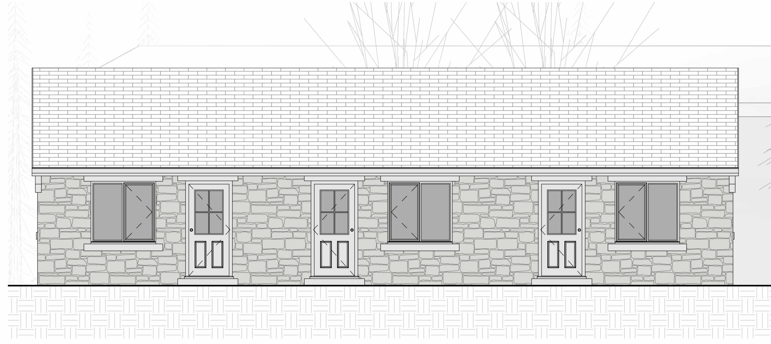
2 Previously Approved North East 1: 50