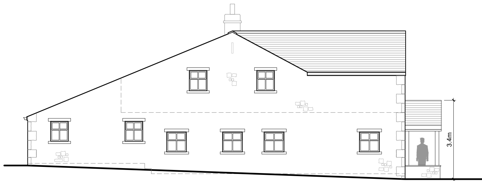
PROPOSED NORTH ELEVATION Scale 1:100