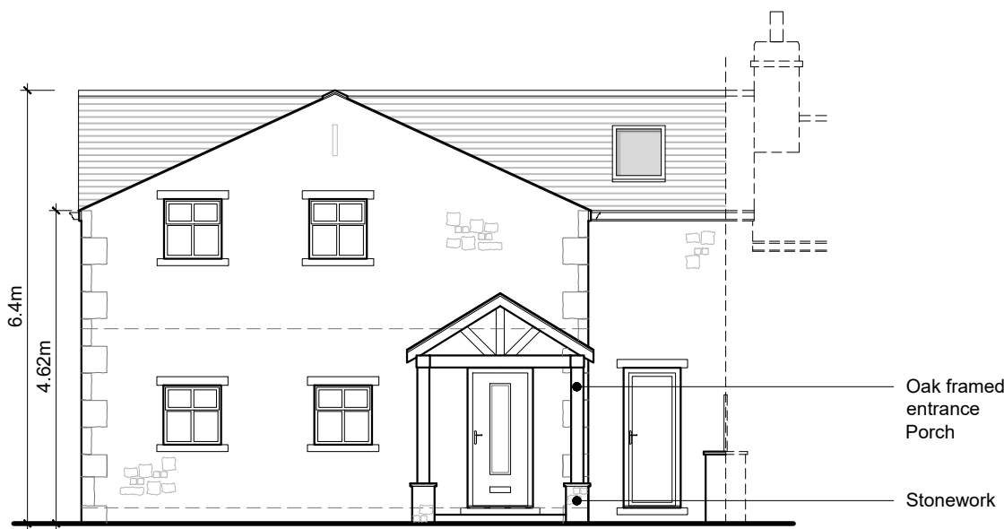
PROPOSED WEST ELEVATION Scale 1:100