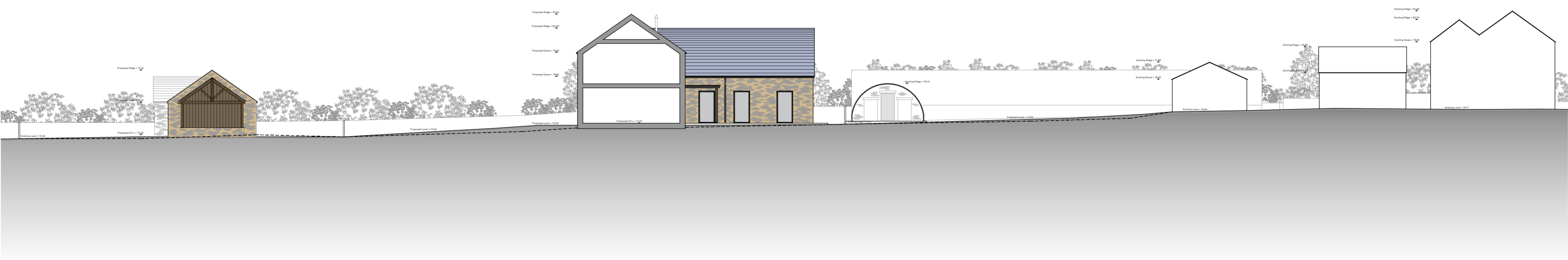
Section As Proposed