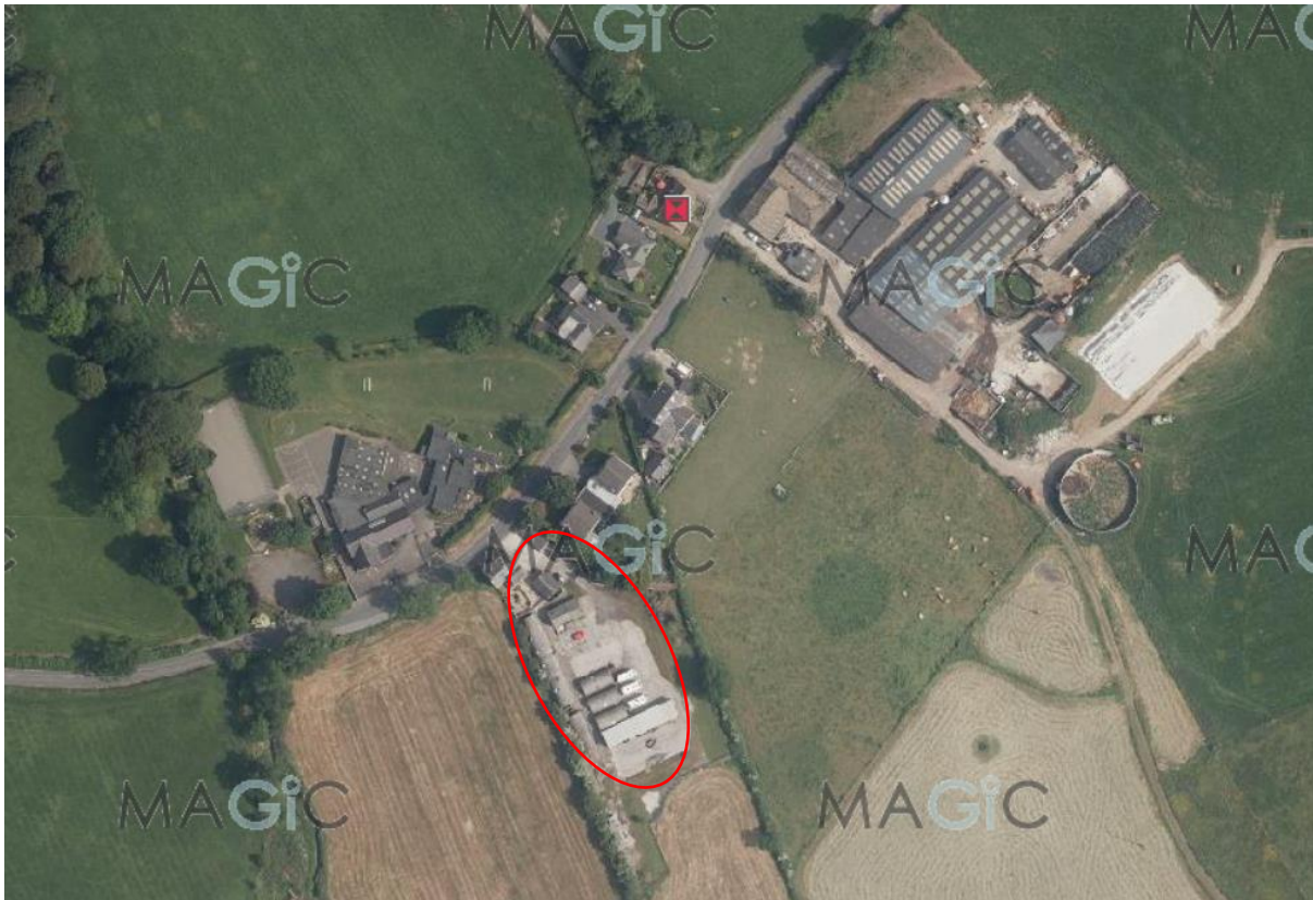
Figure 2: Context of the application site to the nearest listed building know as Lane Side.

It is considered that the proposed site does not impact on the setting of the listed building at Lane Side. Indeed, the proposed development is set beyond existing modern housing development within a light industrial site (B1c). The light industrial site is a mixture of varying built forms and substantial amounts of hardstanding.