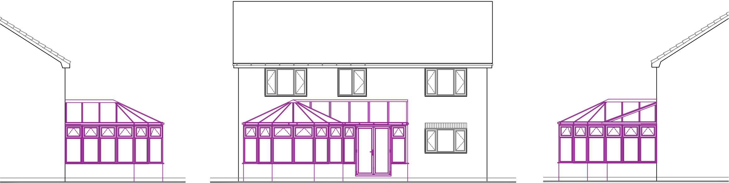
Side Elevation Partial