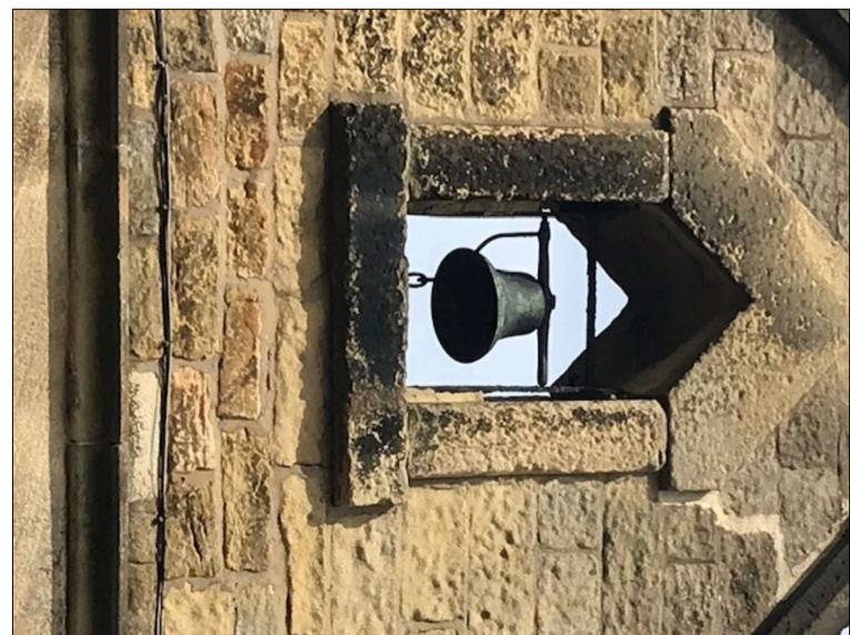
Historic Photograph of local similar bell tower