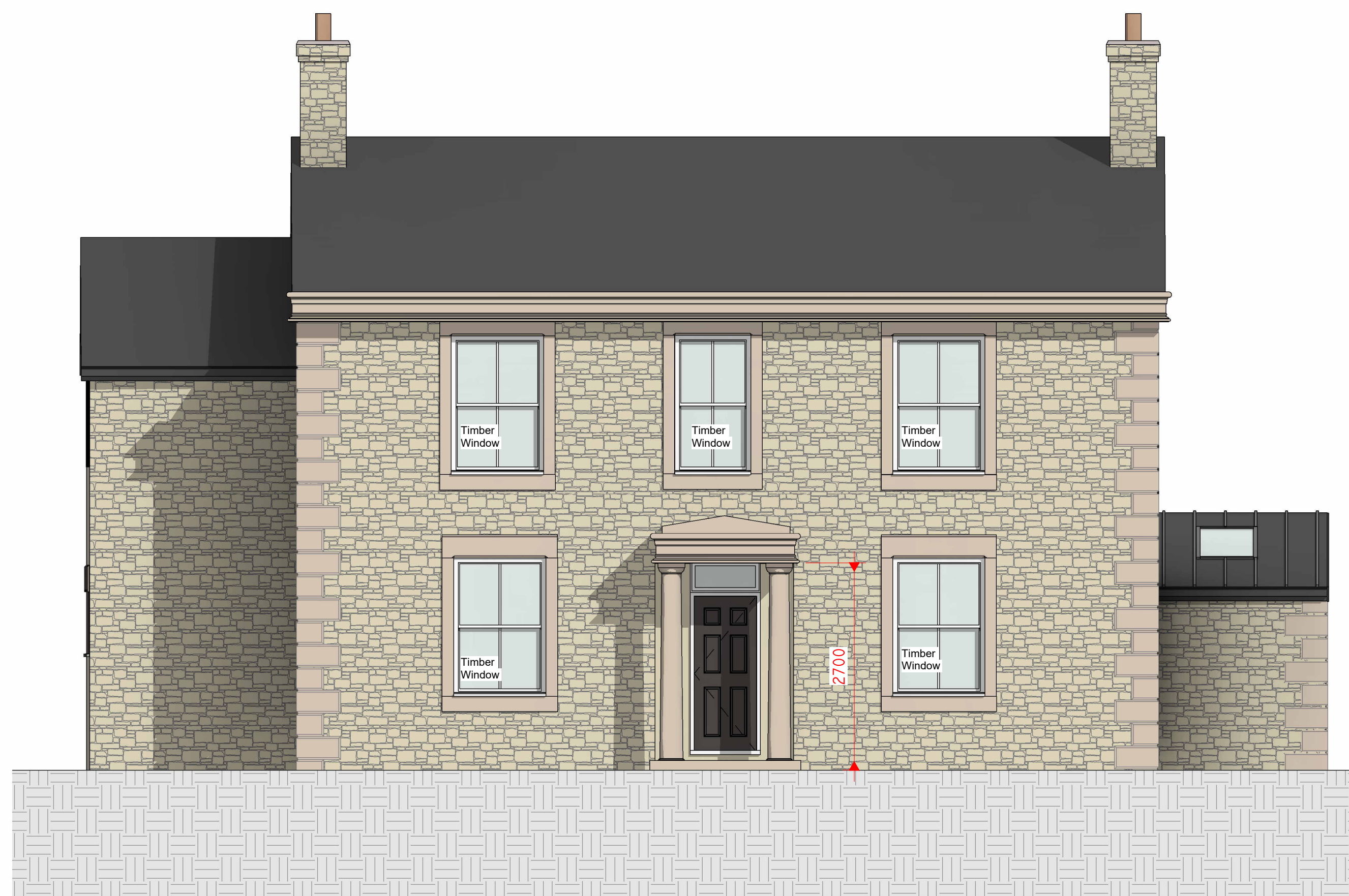
1 PROPOSED WEST. 1 : 50