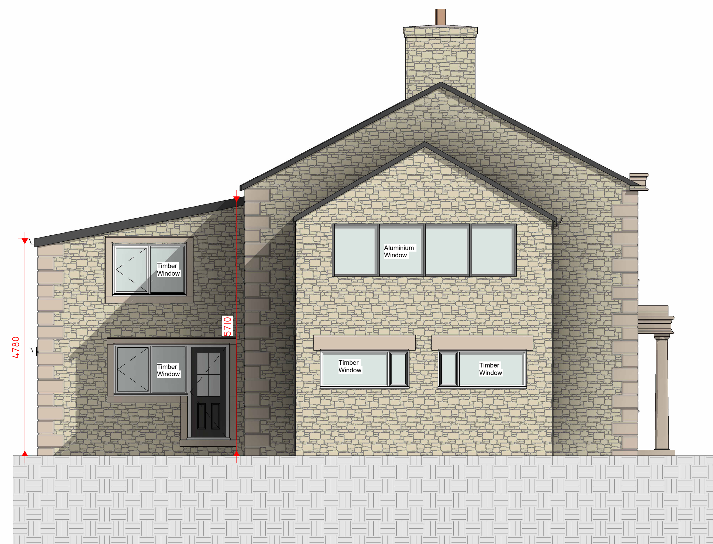
3 PROPOSED NORTH. 1 : 50