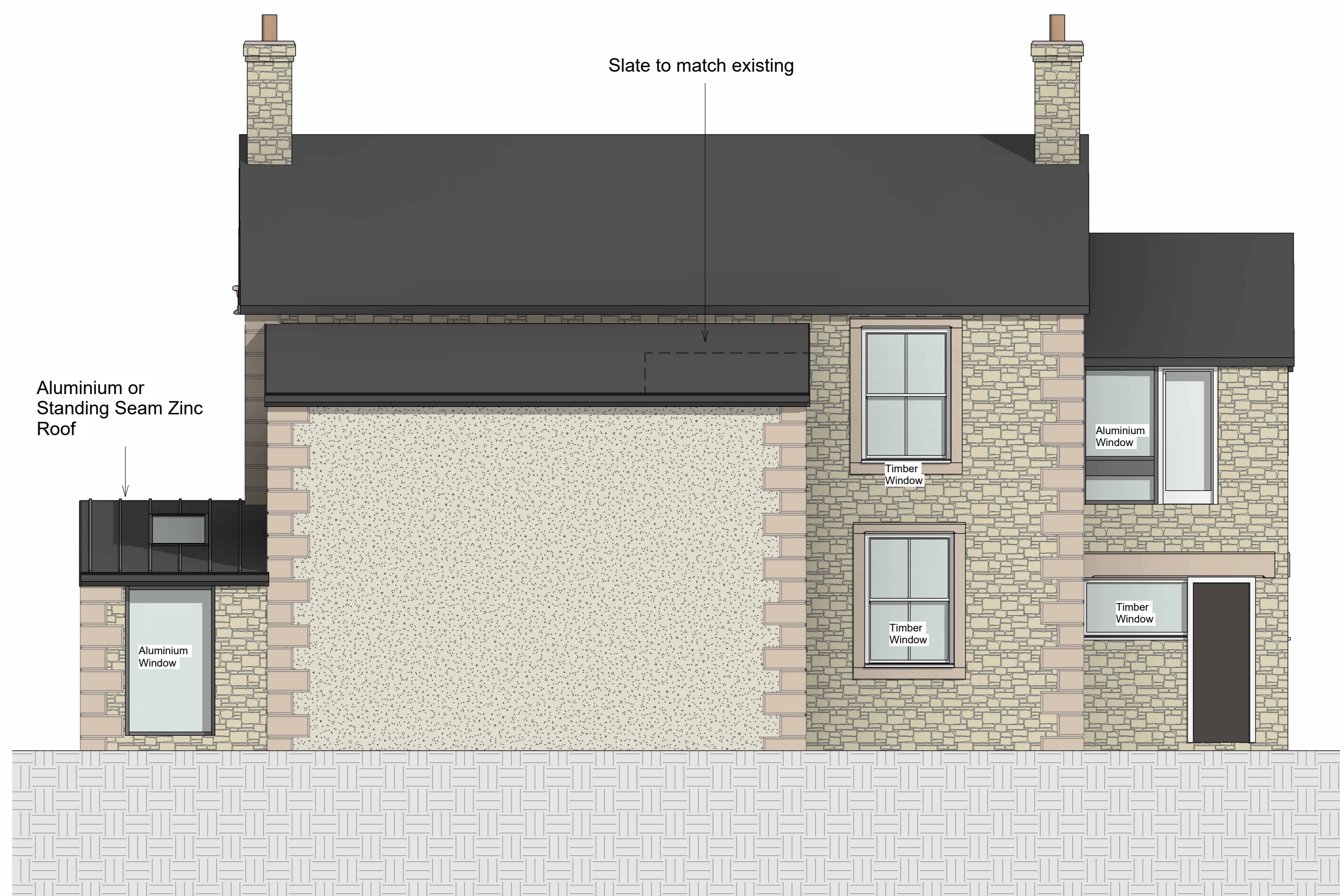
4 PROPOSED EAST. 1 : 50