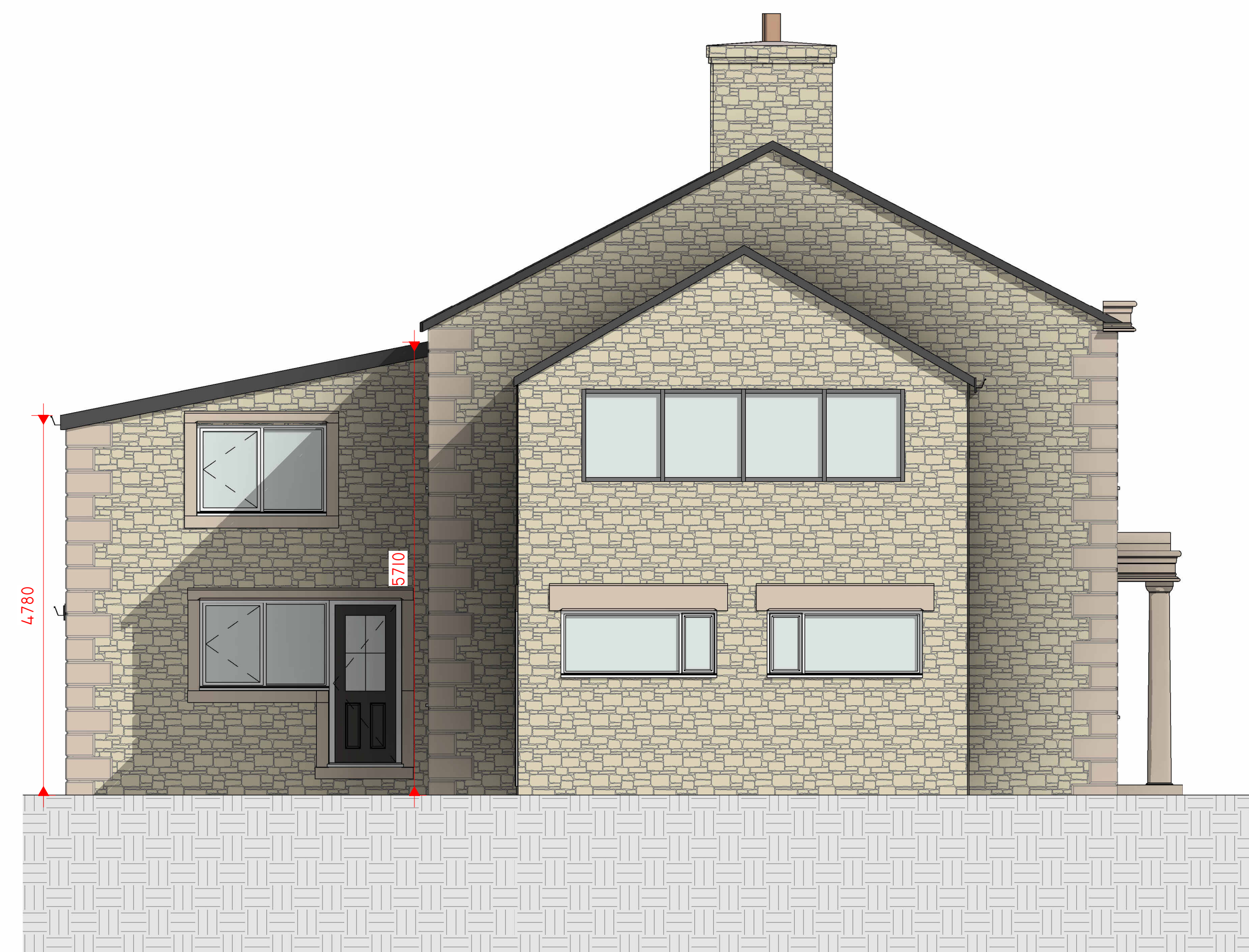
3 PROPOSED SOUTH 1 : 50