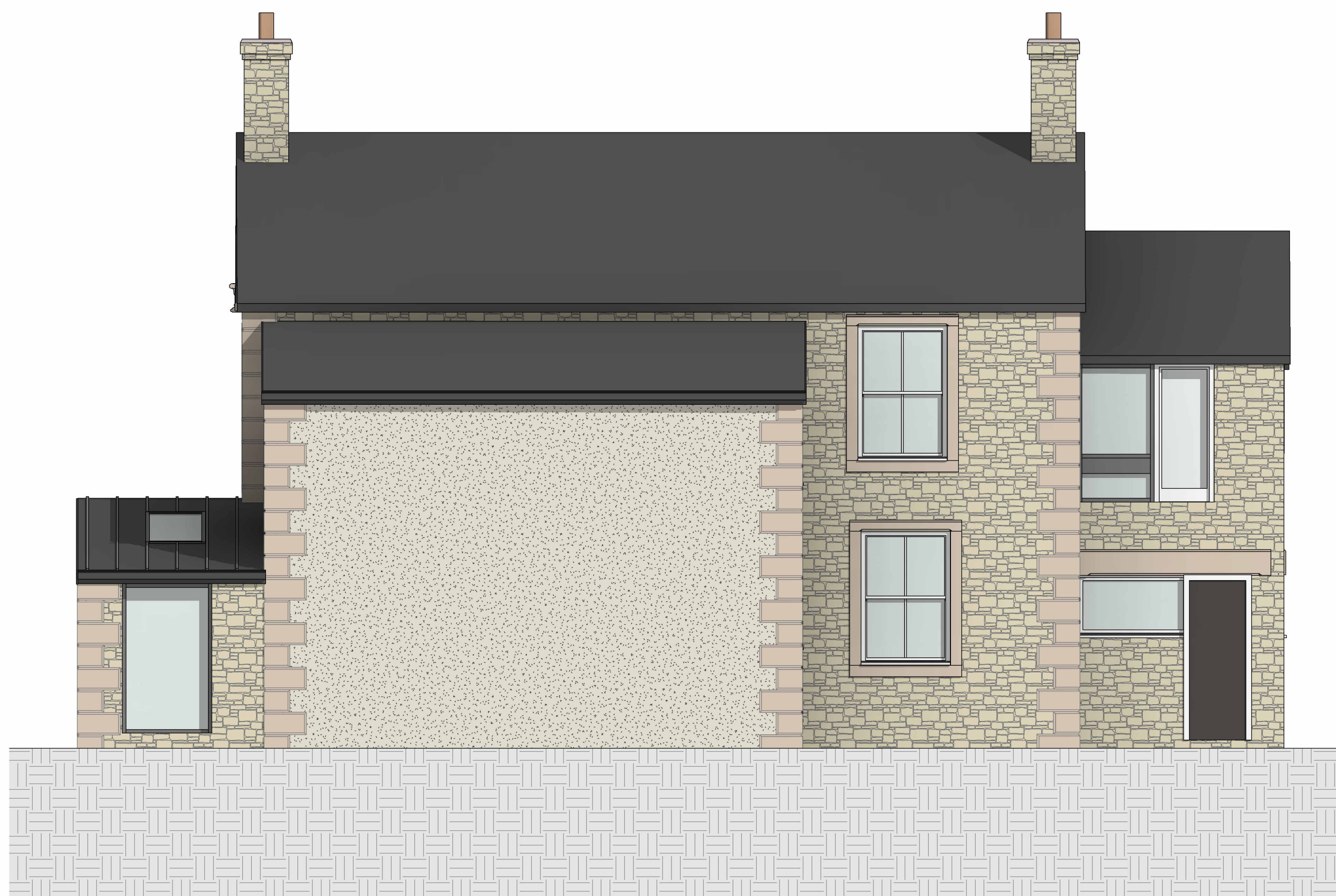
4 PROPOSED WEST 1 : 50