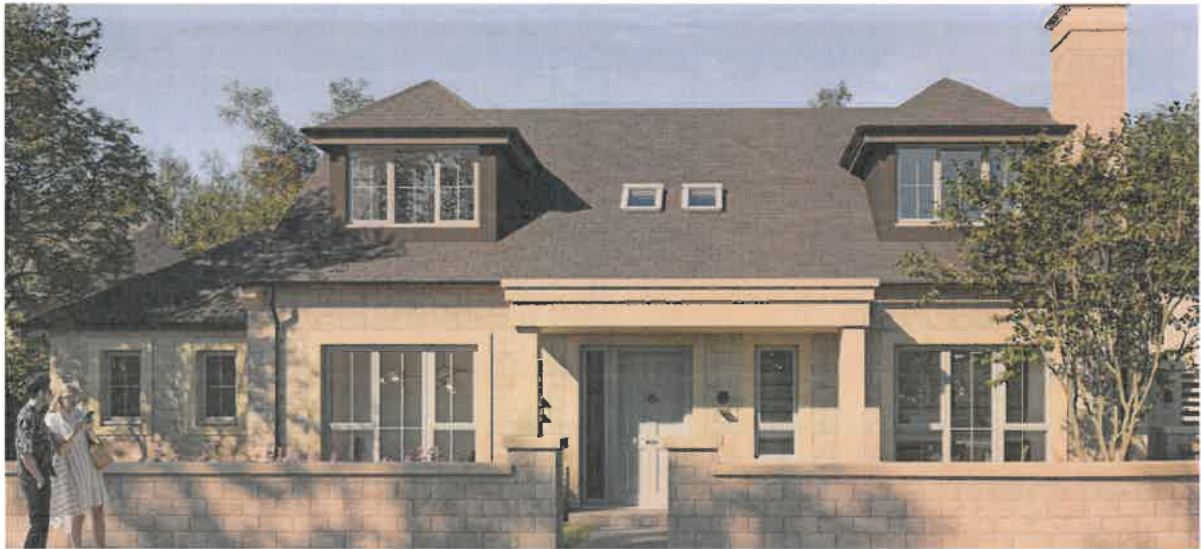
^ Figure 1 – Proposed Plot 8 frontage with light grey doors and windows.

White render formed part of the consented package of materials, to be used on the feature gables for a number of the houses. However, it is proposed to use the Marshalls Darlstone buff across these areas instead, as this represents a better quality, better wearing alternative. The design quality of the houses is such that the introduction of a further external facing material (render) is considered to be unnecessary (as demonstrated by Figure 2 , below).