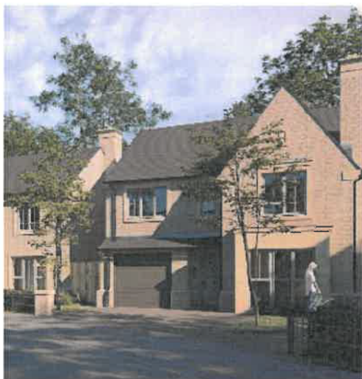
Figure 2- Proposed image of Plot 2

Charcoal coloured roof tiles are still being proposed, as with the Consented Scheme, however the manufacturer has changed from that referenced on the previously approved plans (See attached Materials Schedule by mpst).