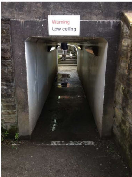
The benefit of the dark, dank underpass.

The plans imply there is easy access to Langho Station and pedestrian access to the village. The footpath from the development will run beneath the railway line via a pedestrian underpass. However it totally ignores the severe limitations of this underpass and steps. Surely this is in breach of accessibility requirement guidelines? To base much of a travel plan, for example travel to local amenities, shops, schools, the train station and local bus routes on such discredited provision is a disgrace and naive in the extreme. This dark, dank and sometimes flooded underpass is just 1370mm wide and 1980mm high. The south end of this underpass has 19 steps to reach the level of the A666 Whalley Road. This route is totally unsuitable for the very young, elderly or those with any physical disability. Parents with prams face a very challenging obstacle.