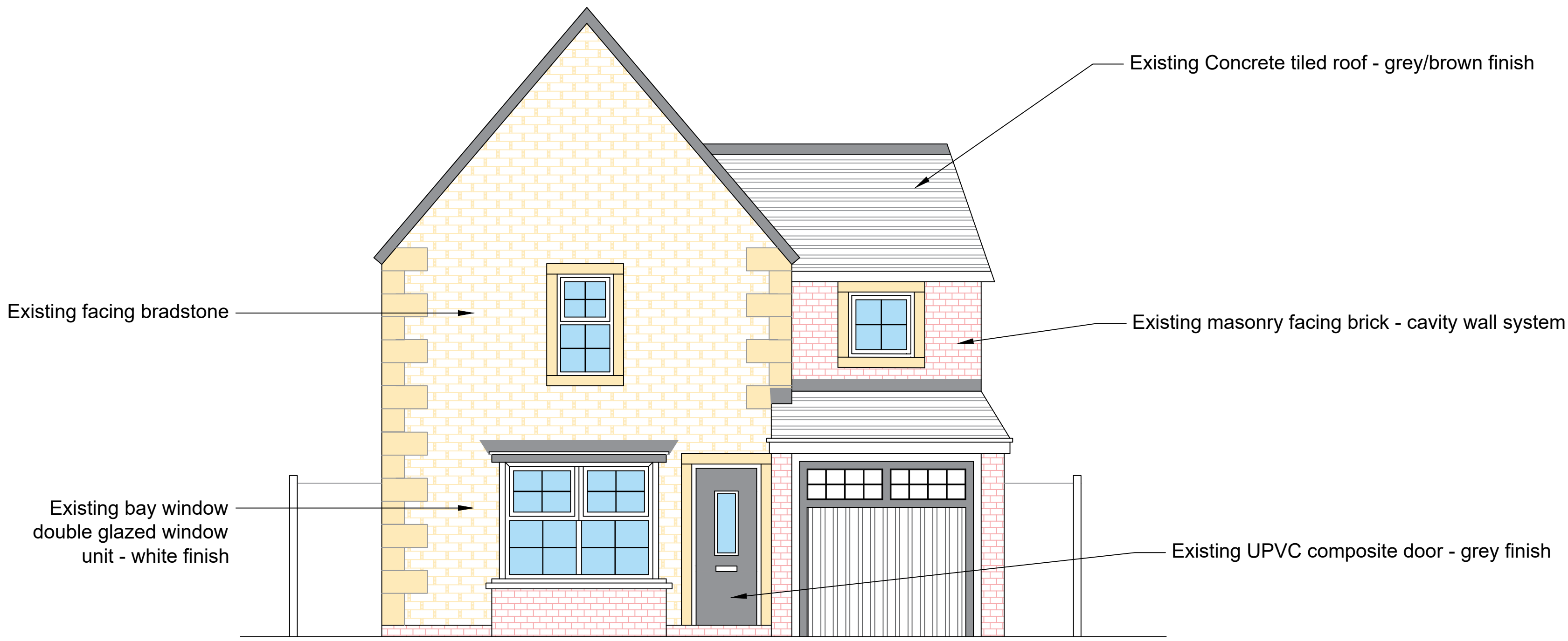
EXISTING NORTH FACING ELEVATION - SCALE 1 / 50 @ A0