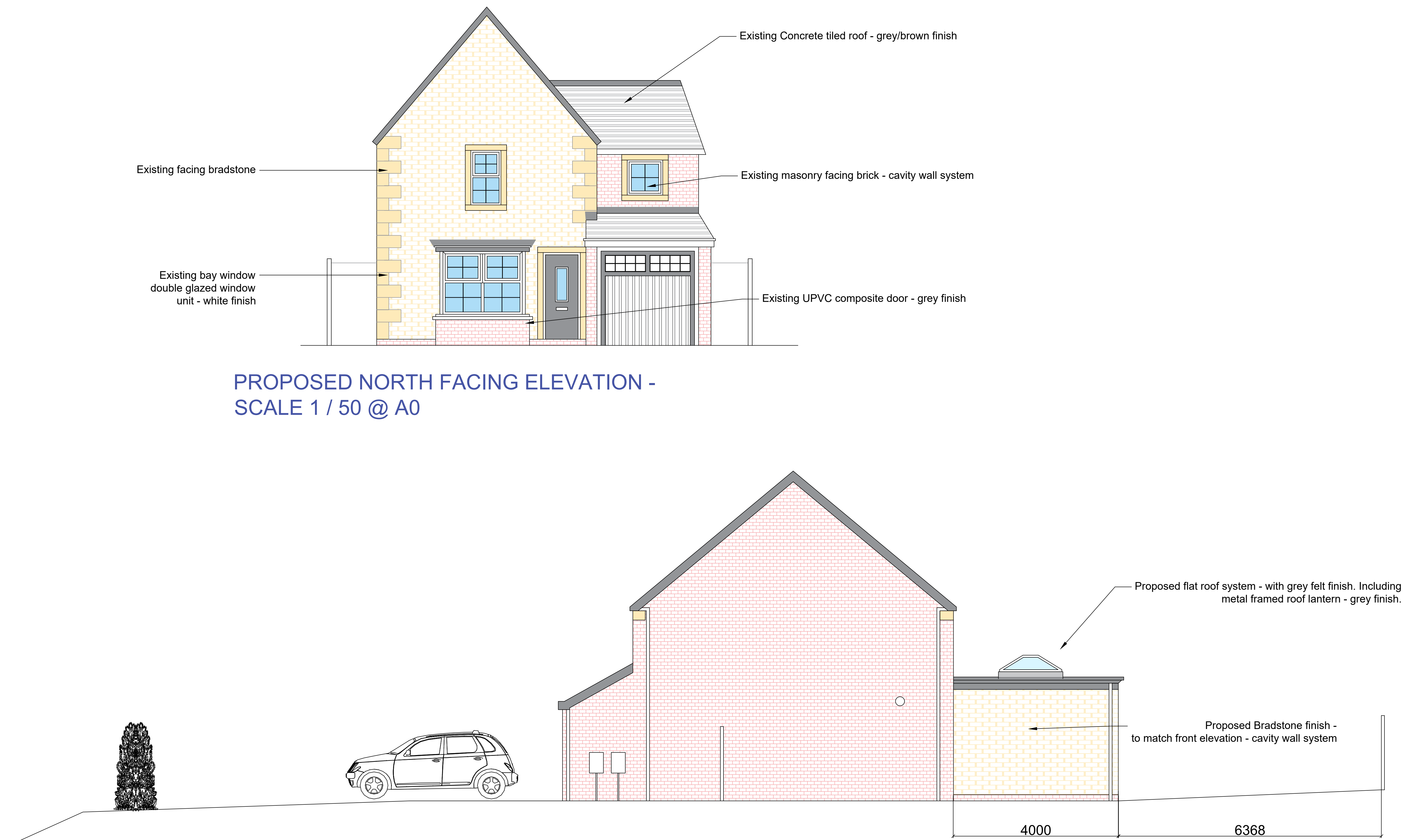
PROPOSED WEST FACING ELEVATION - SCALE 1 / 50 @ A0