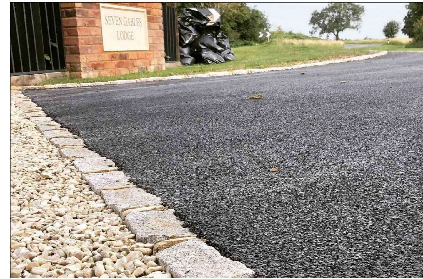
Tarmac Road & Edge Detail