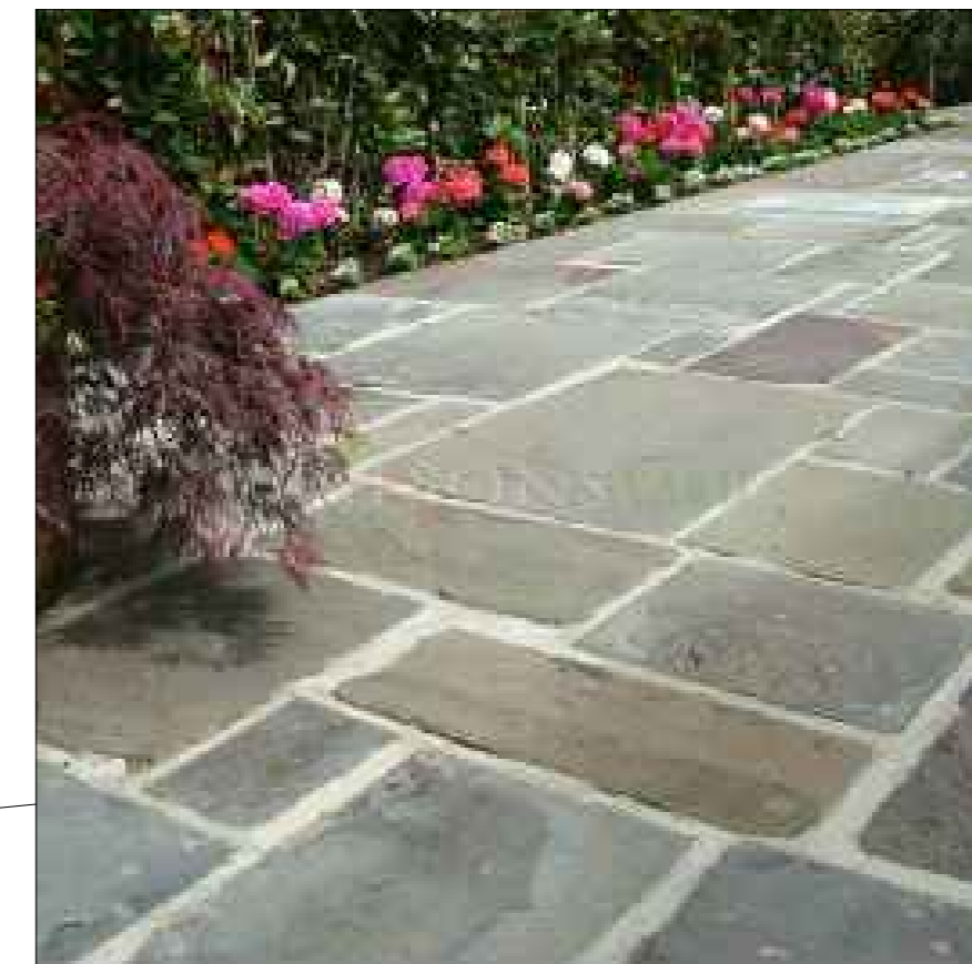
STONE FLAG DETAIL