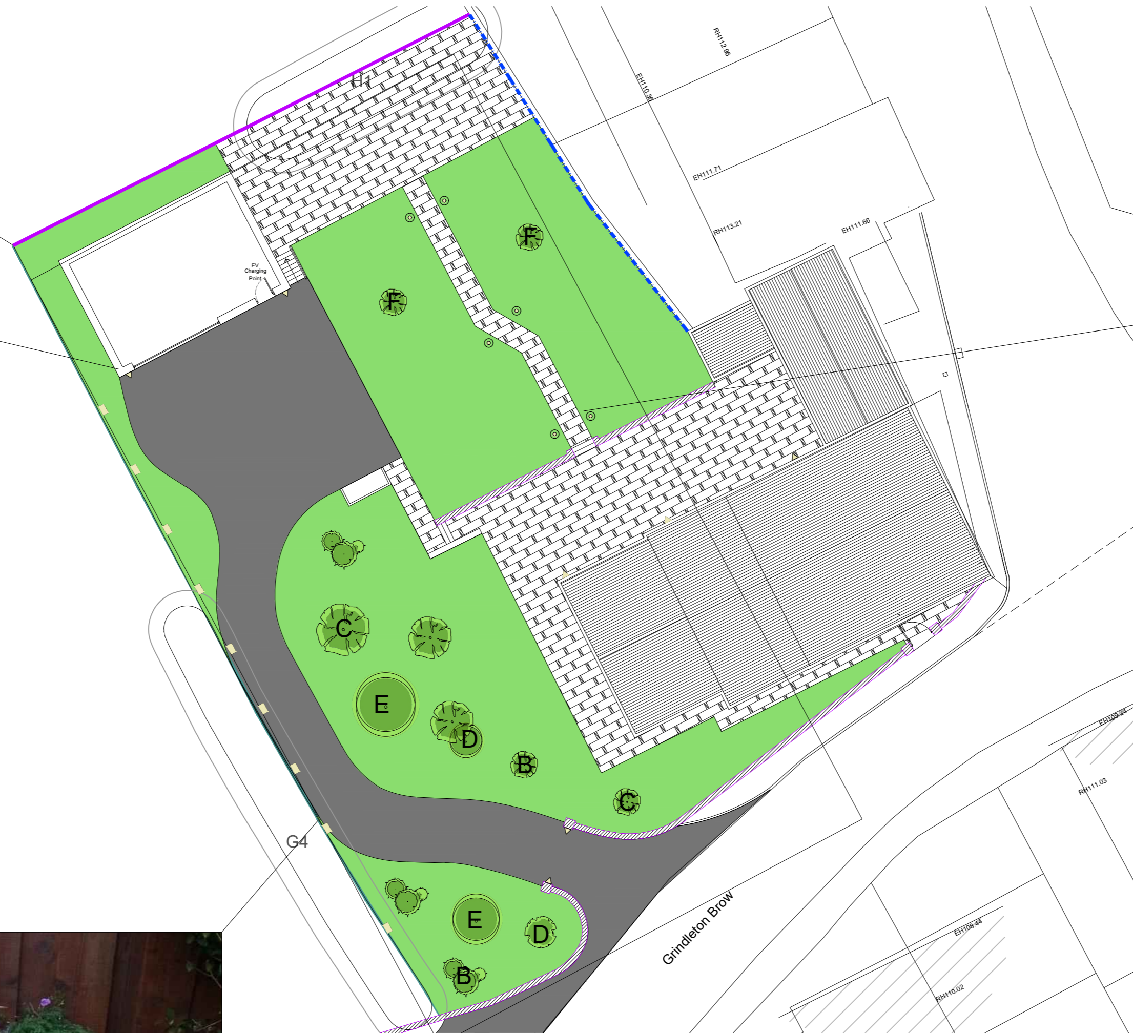
Landscape Site Plan Scale 1:200 @A2