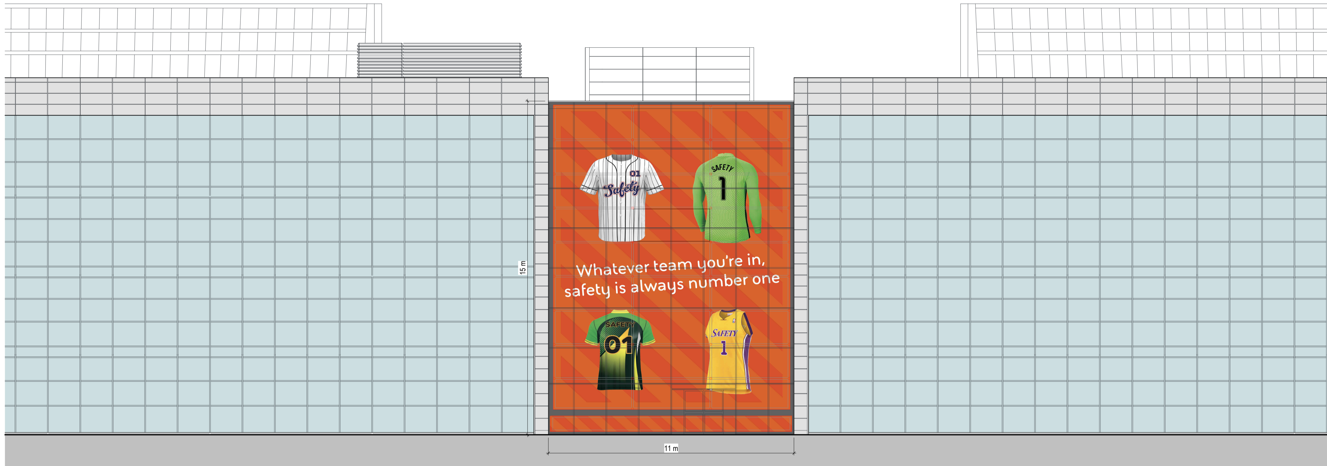
SIGNAGE D - 15.5m x 11.5m non illuminated sign