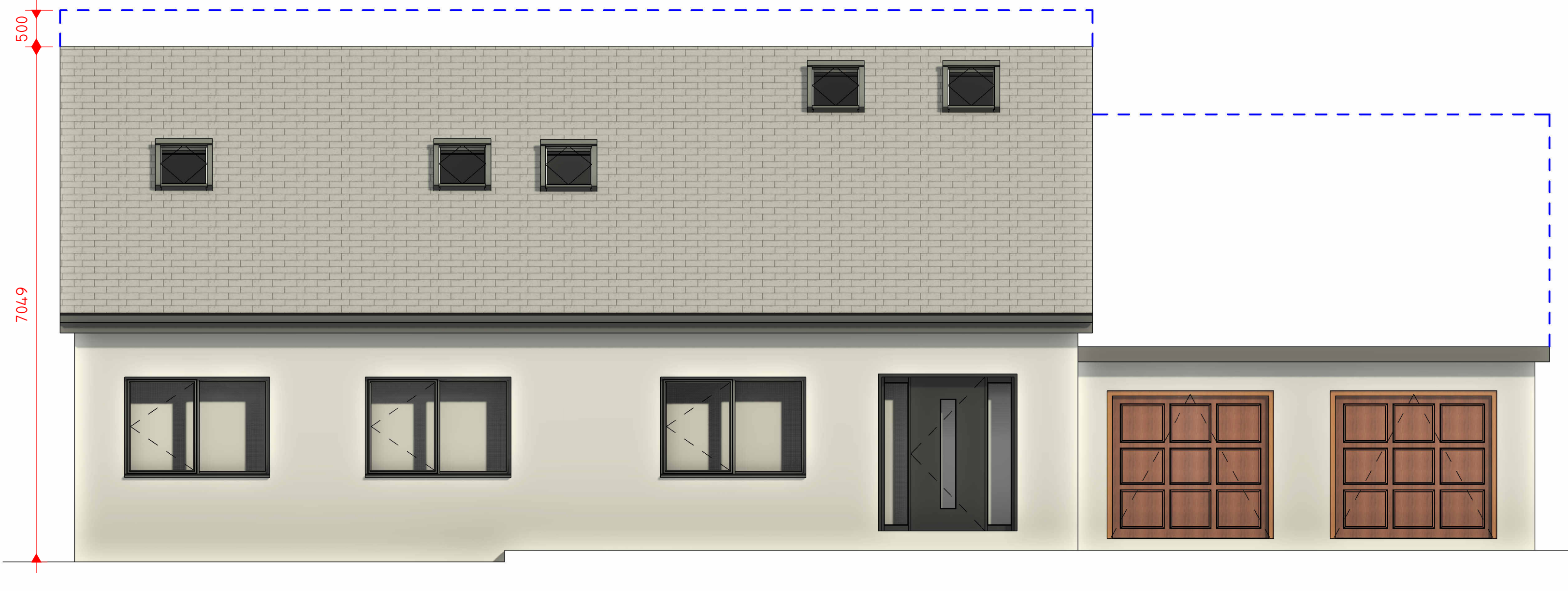
3 PROPOSED SOUTH 1 : 50