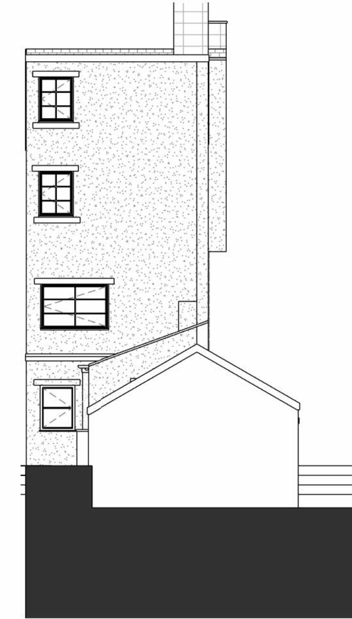
3 North Elevation 1:100