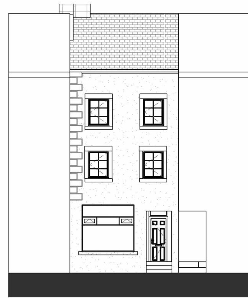
4 South Elevation 1:100