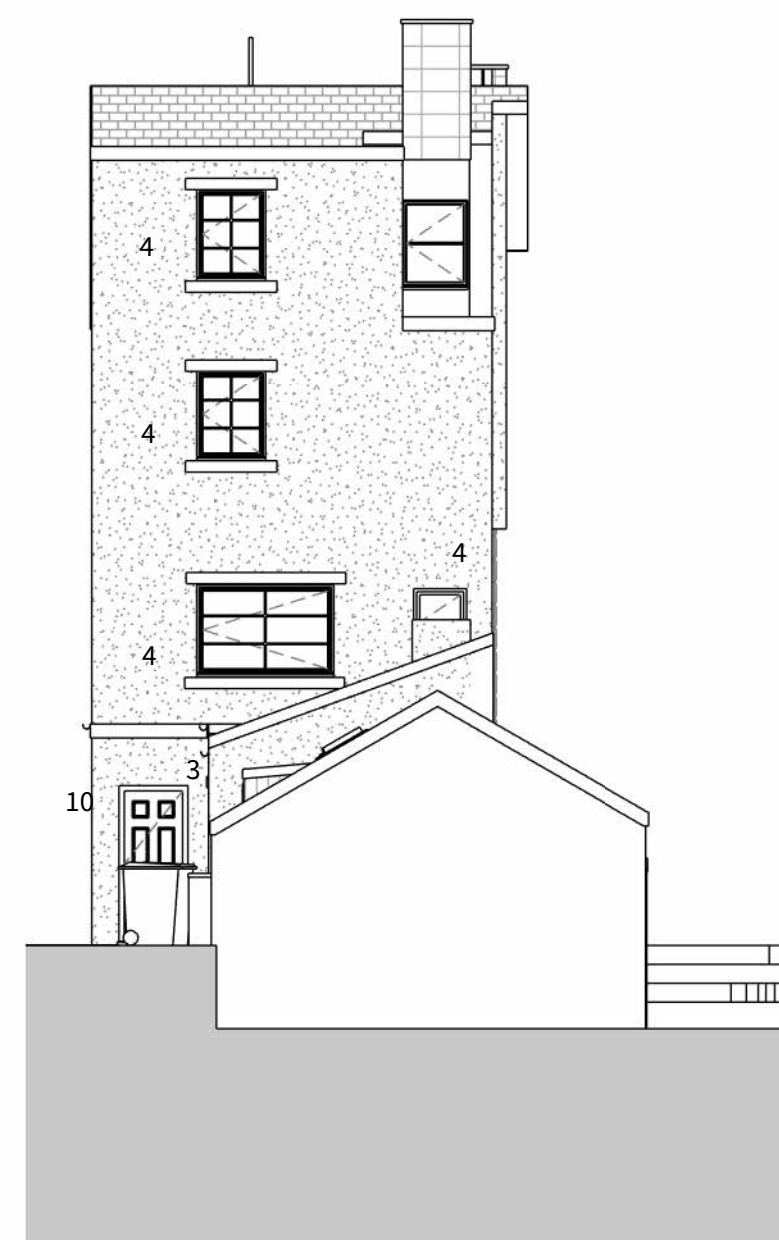
3 North Elevation as Proposed 1:100