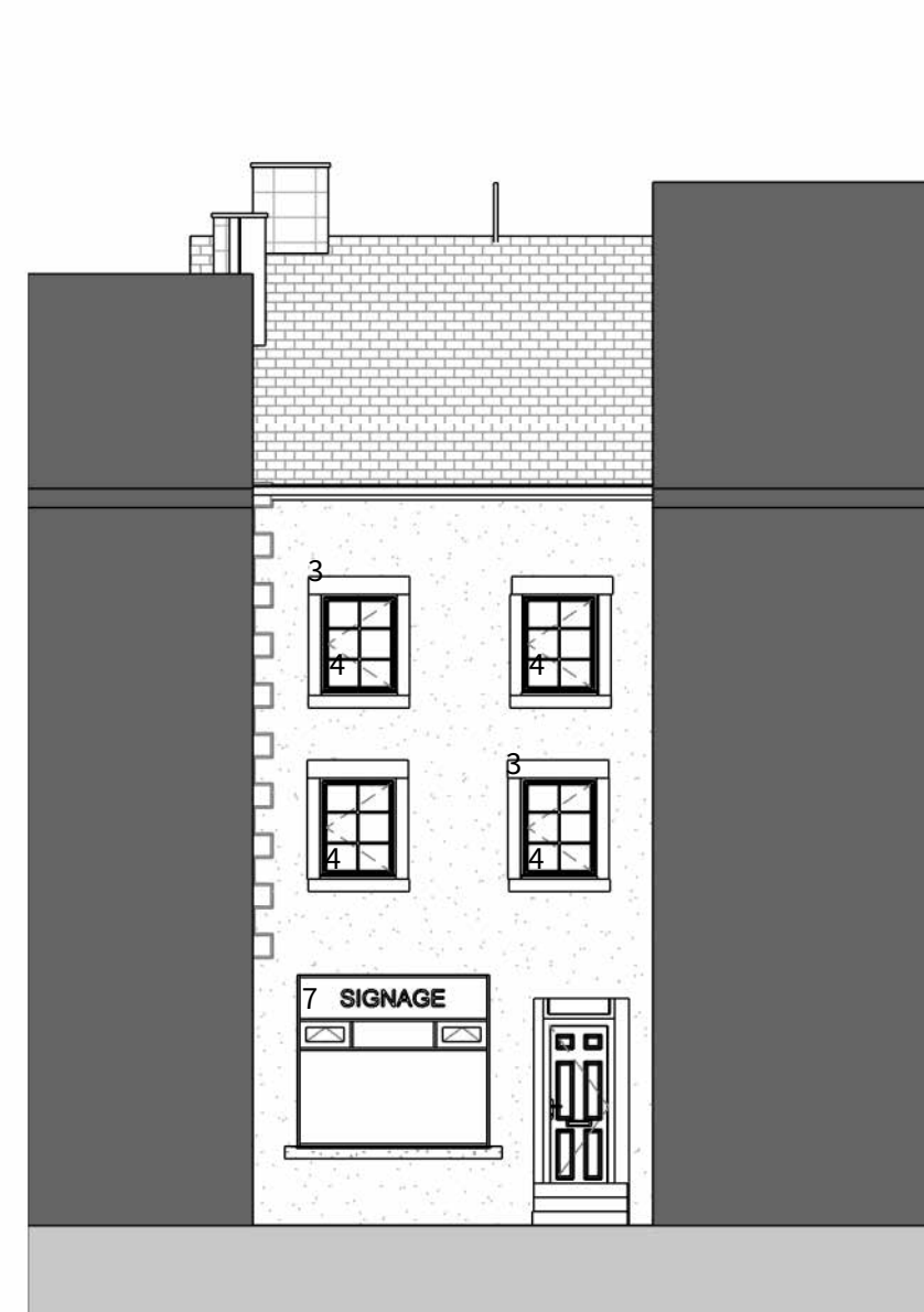
4 South Elevation as Proposed 1:100