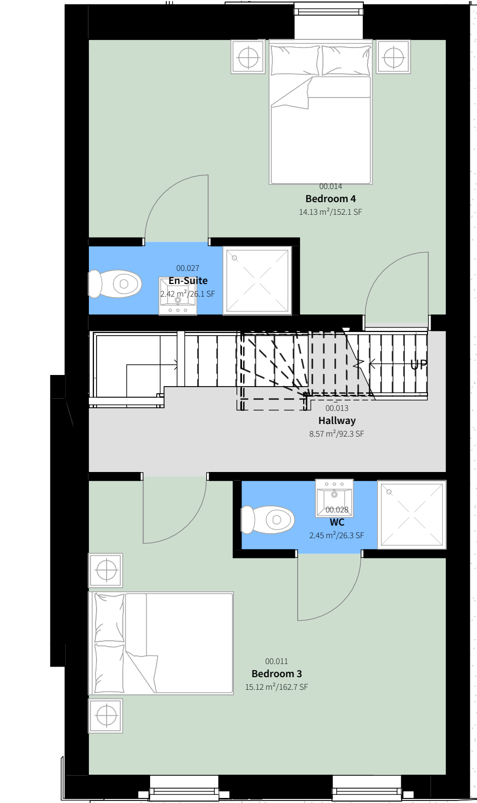
2 02-Second Proposed 1:50