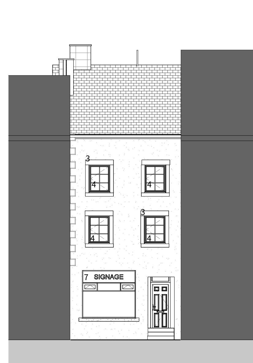
4 South Elevation as Proposed 1:100