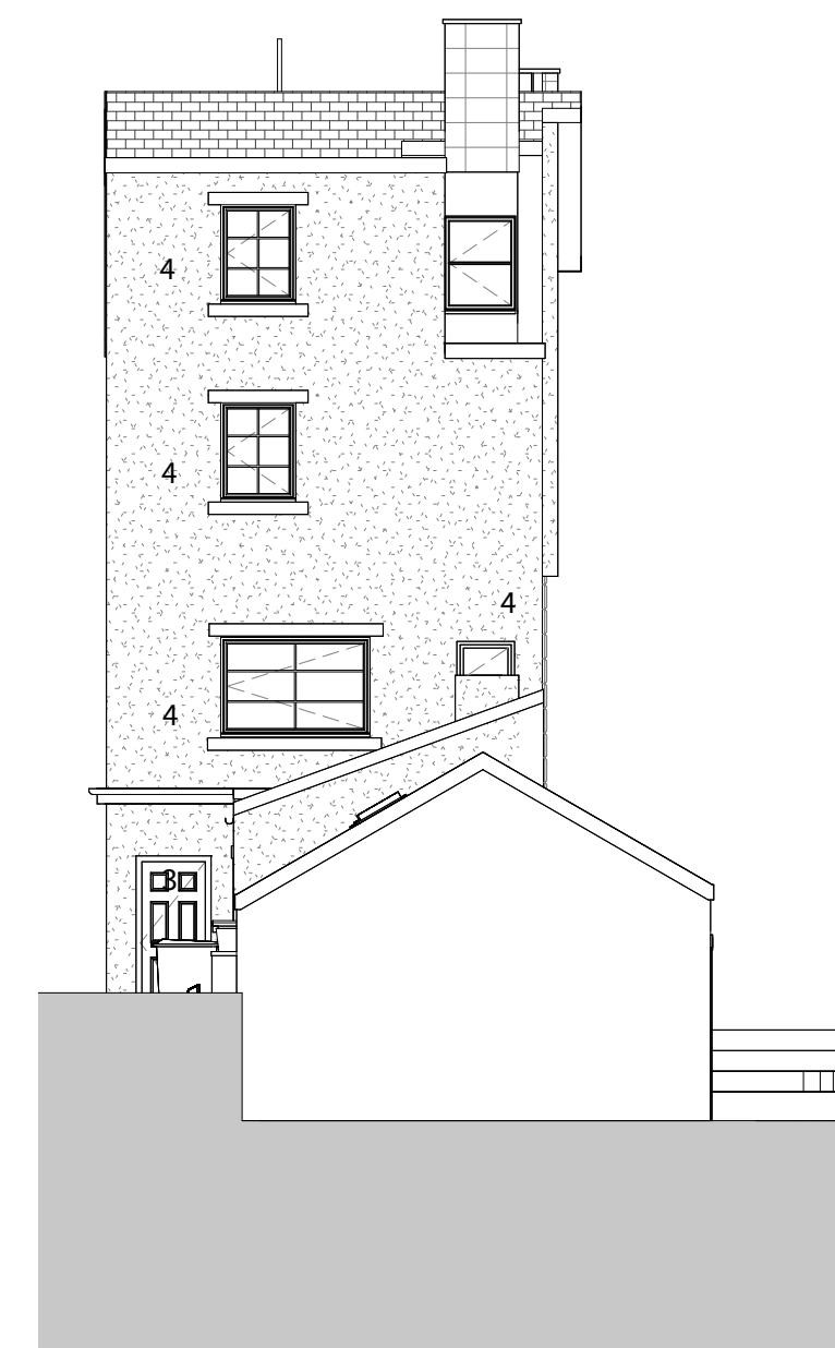
3 North Elevation as Proposed 1:100