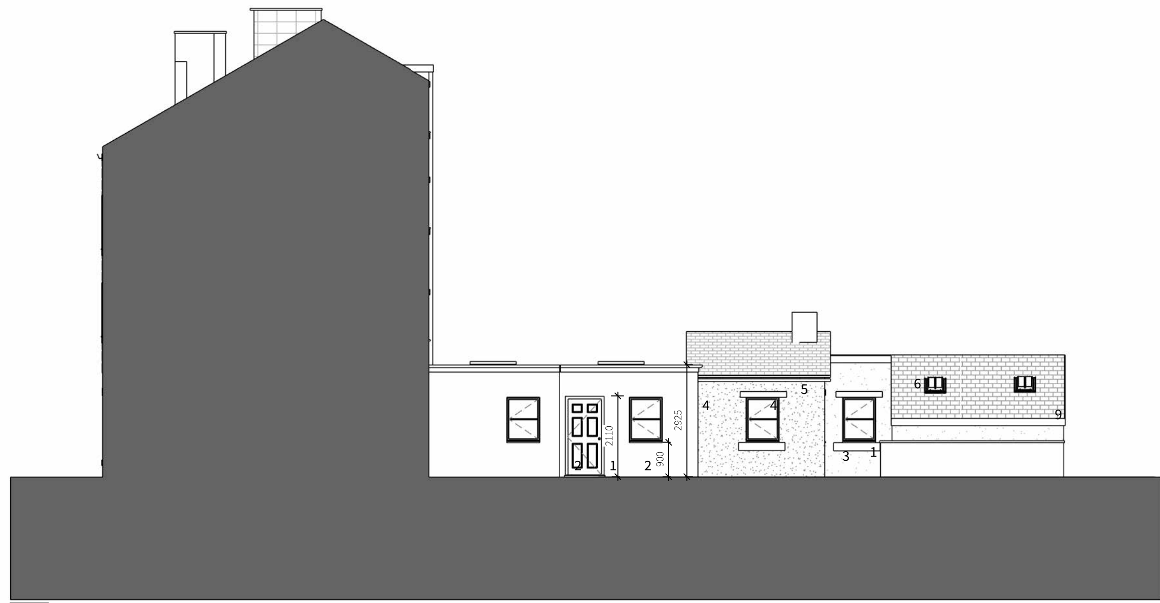
2 East Elevation as Proposed 1:100