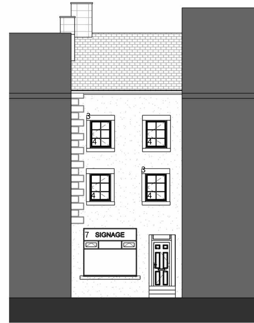
4 South Elevation as Proposed 1:100