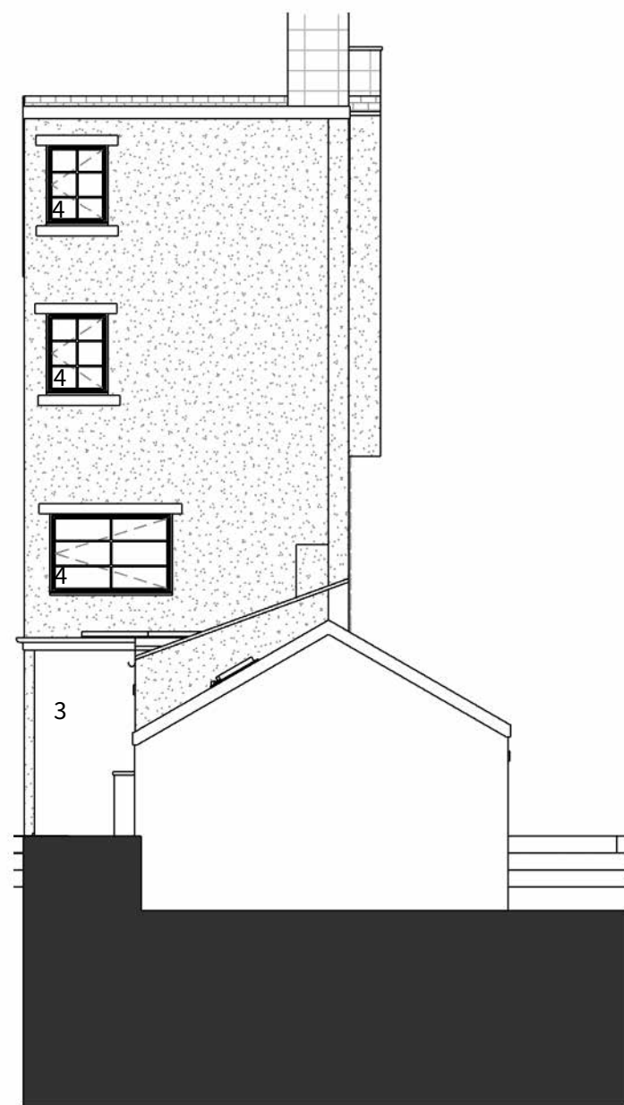
3 North Elevation as Proposed 1:100