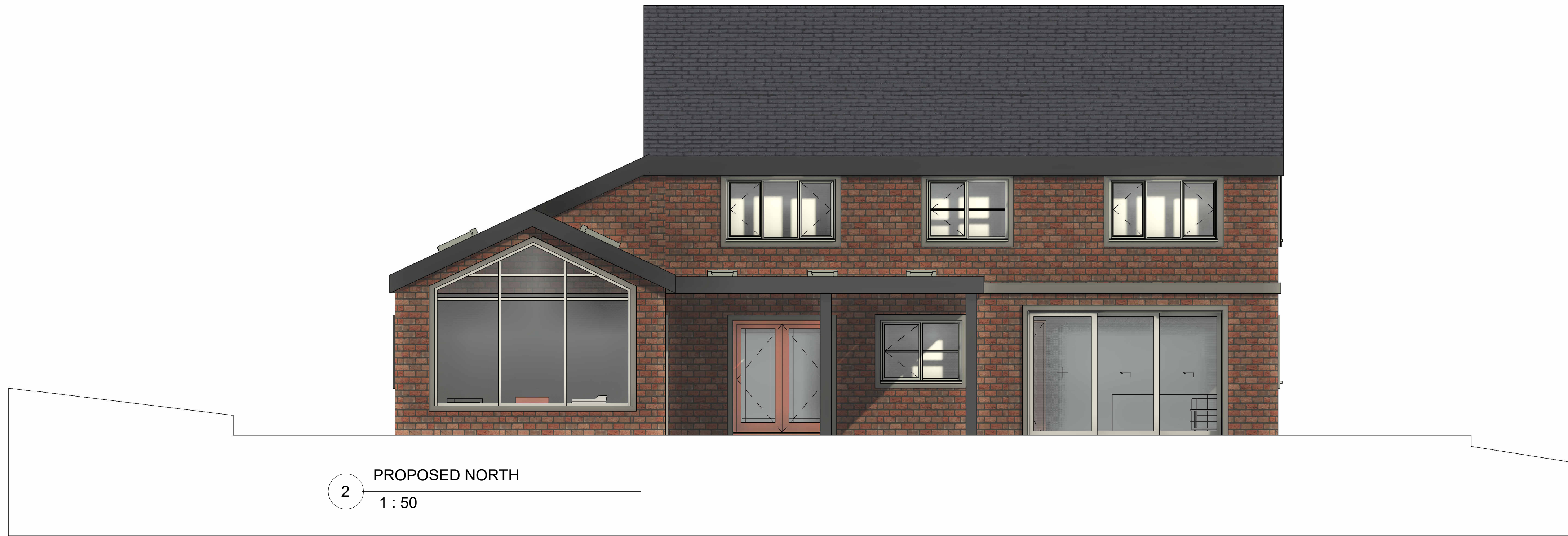
2 PROPOSED NORTH 1 : 50