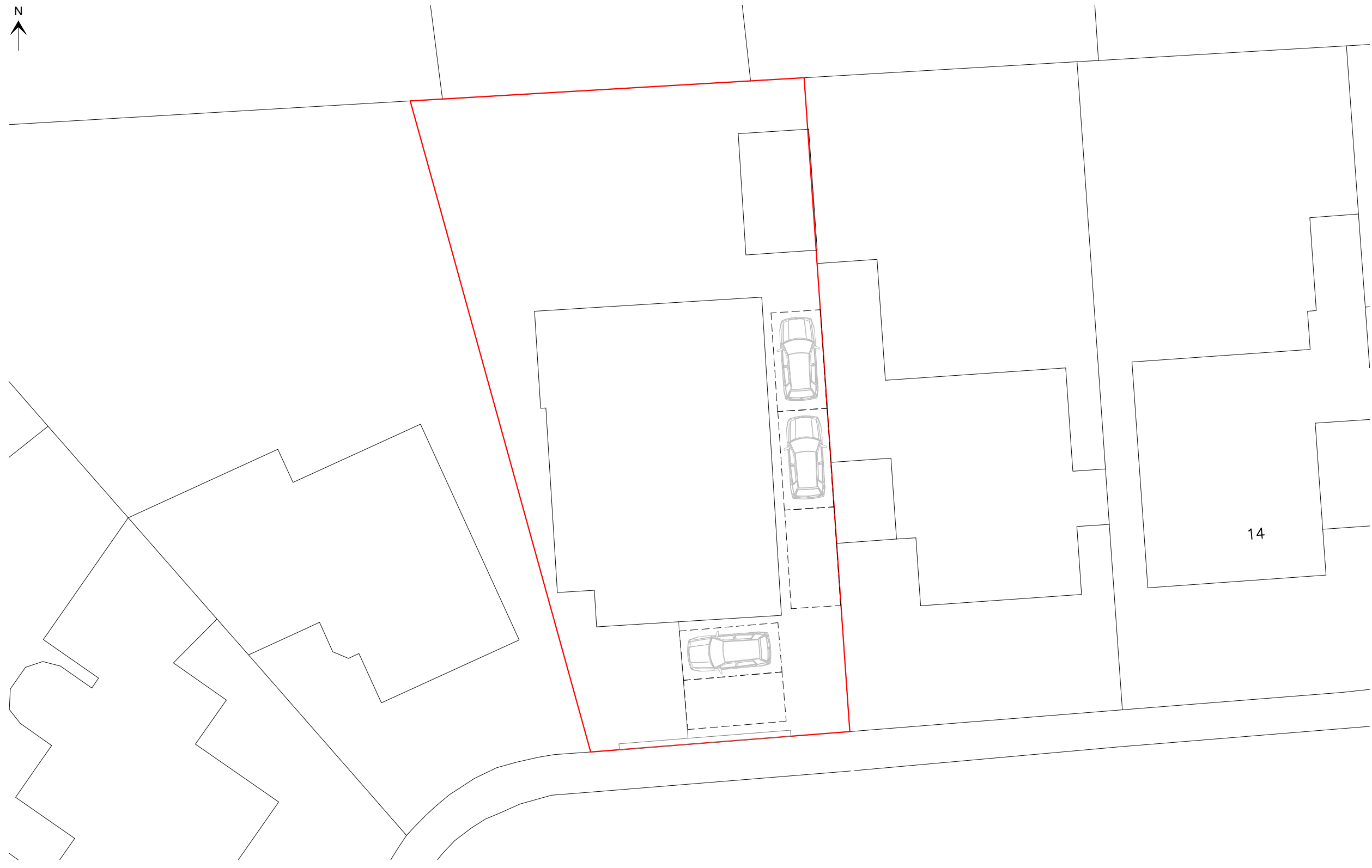
EXISTING SITE PLAN Scale 1:200