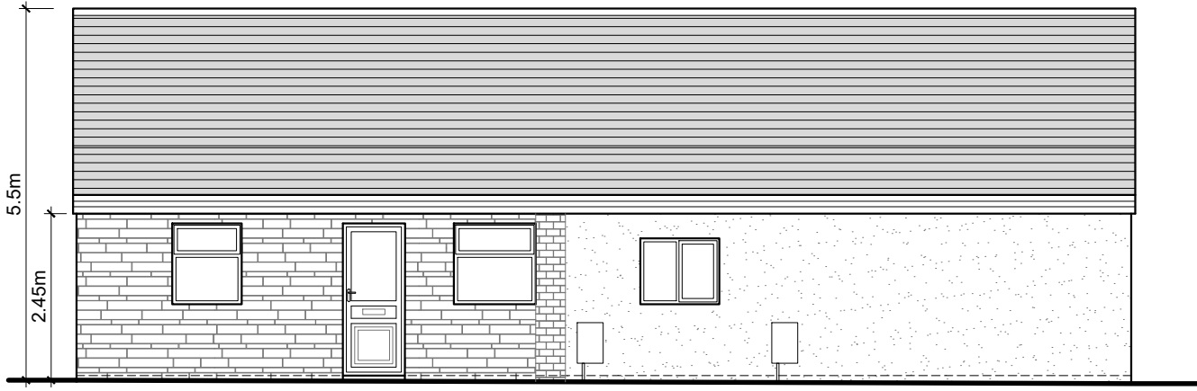
EXISTING EAST ELEVATION Scale 1:100