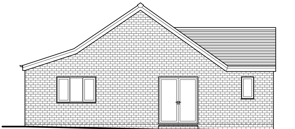
EXISTING NORTH ELEVATION Scale 1:100