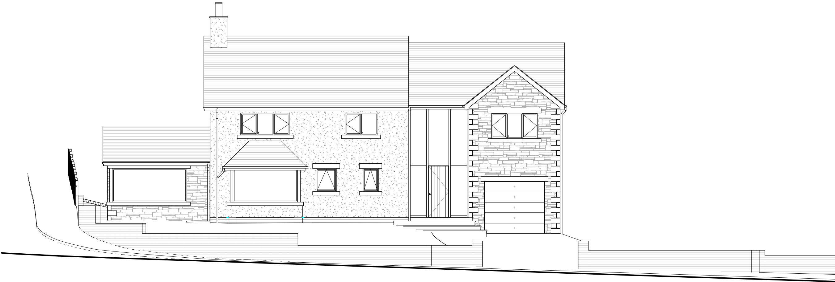
Site SectionI Elevation to Garstang Road