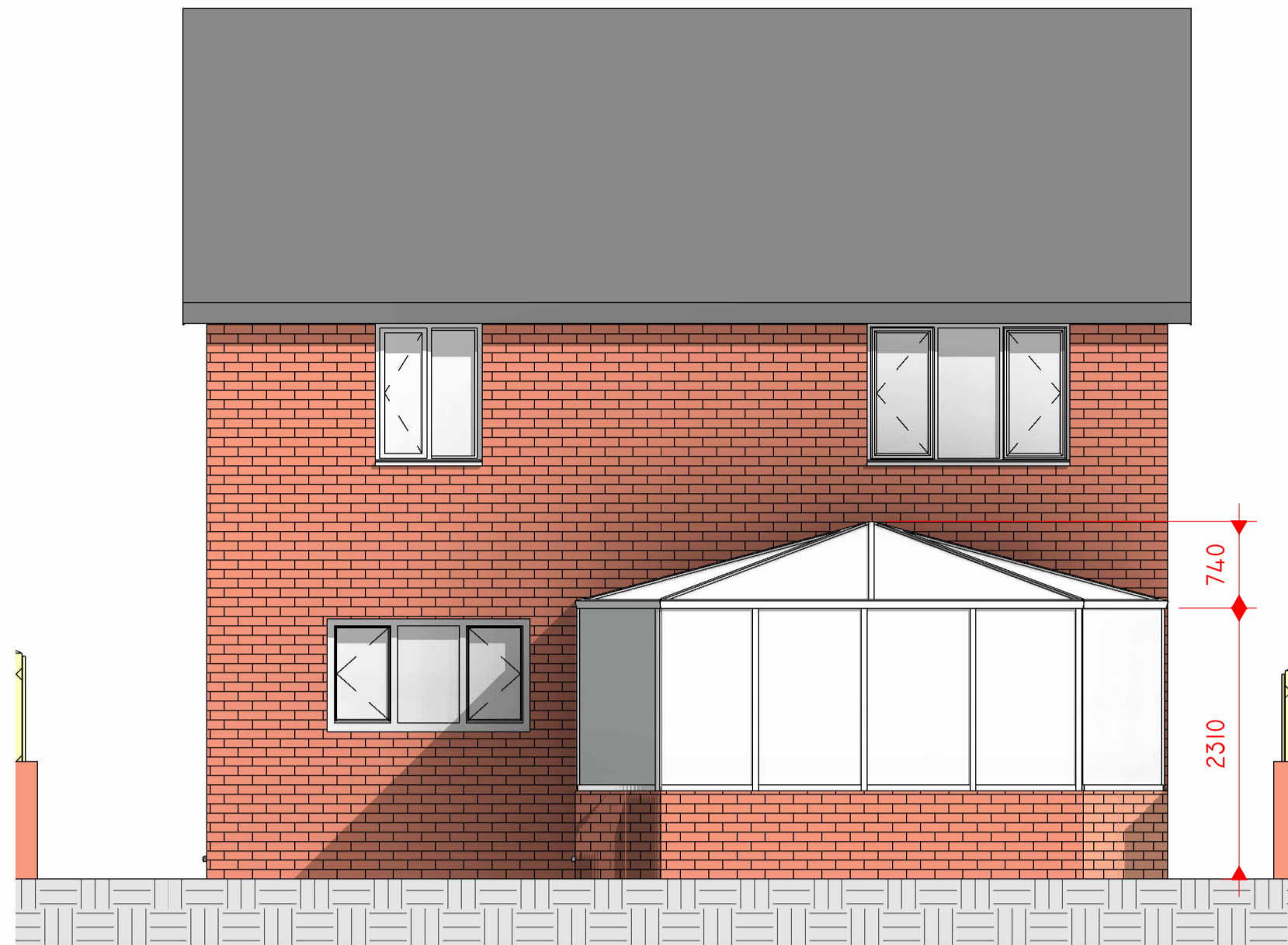
2 1 : 50