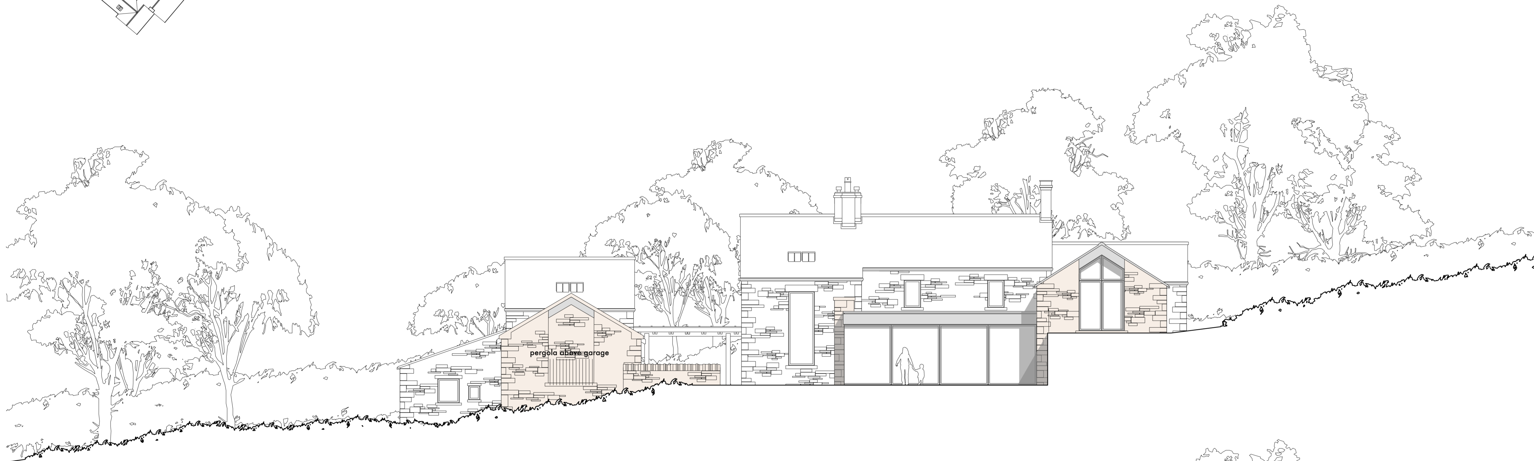
C. north west elevation