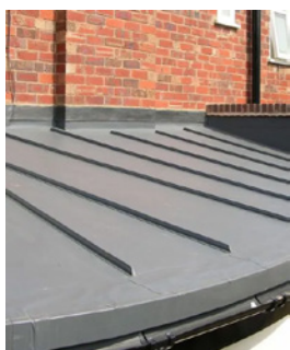
Single ply membrane around roof light.