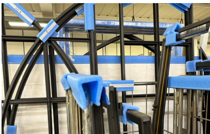
External and internal glazing and hallway door by Bronze Casement.