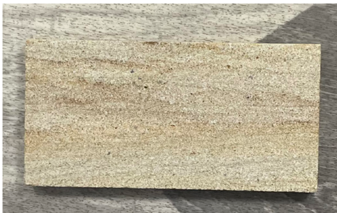
External Sandstone sample.