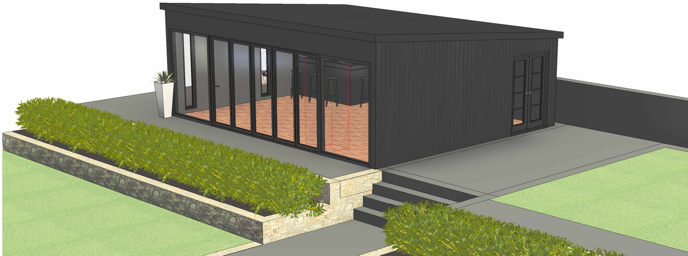
1 3D View 1